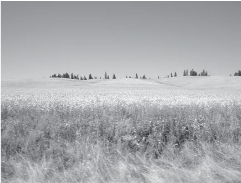
Palouse near Nezperce