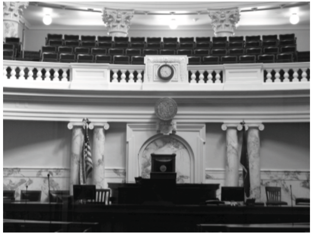
Capitol Chamber & Gallery