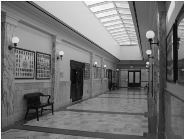
Garden Level Wing