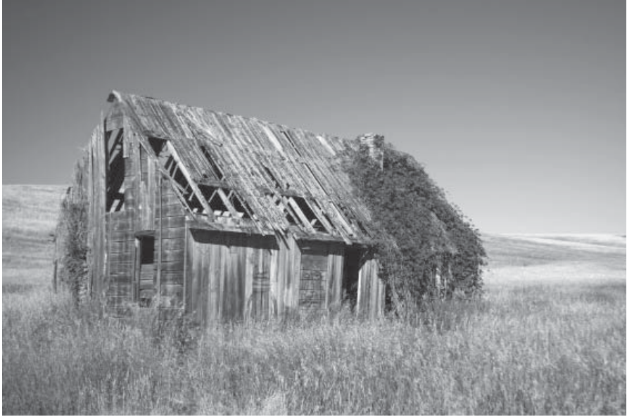
Cabin Ruin near Swan Valley