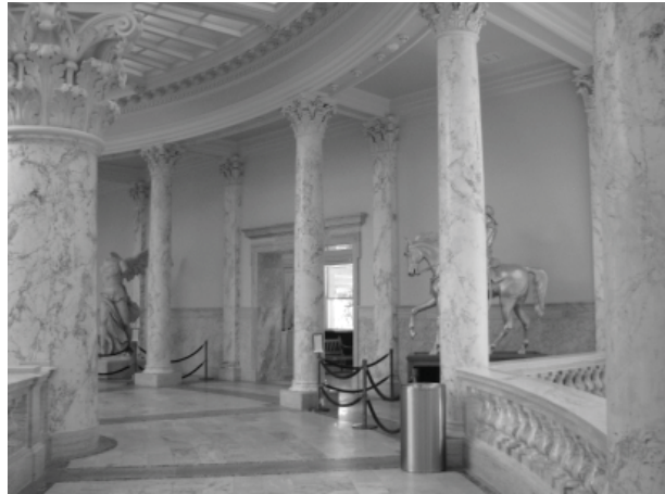
Capitol Fourth Floor