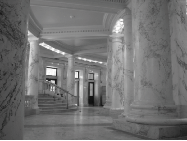
Capitol Second Floor