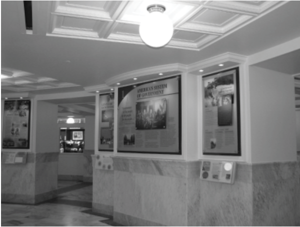
Capitol Garden Level