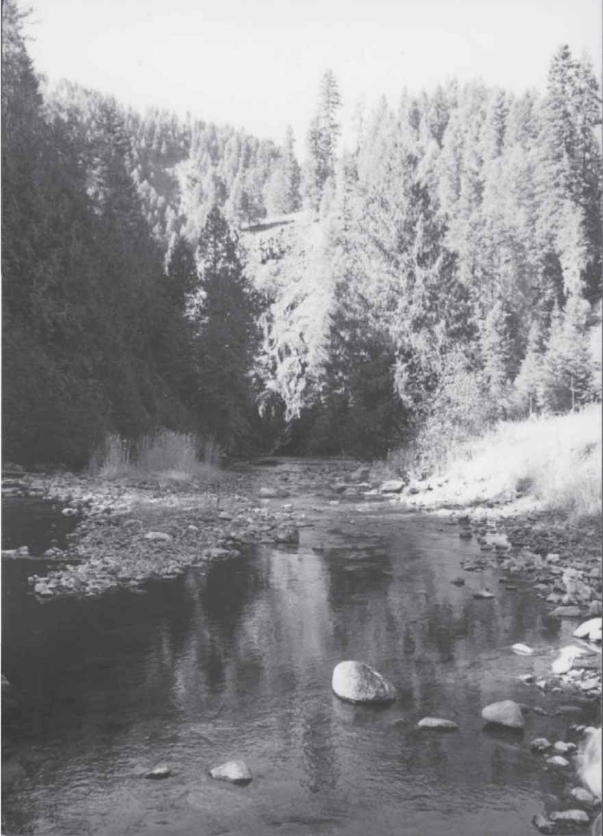
Lolo Creek