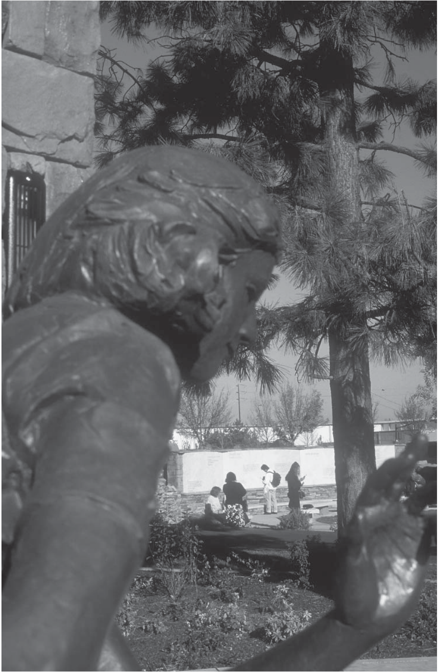
Anne Frank Human Rights Memorial