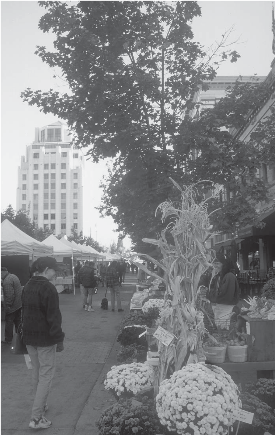
Farmers Market in Downtown Boise