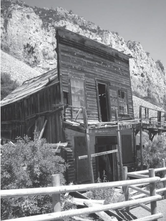
Bayhorse Ghost Town