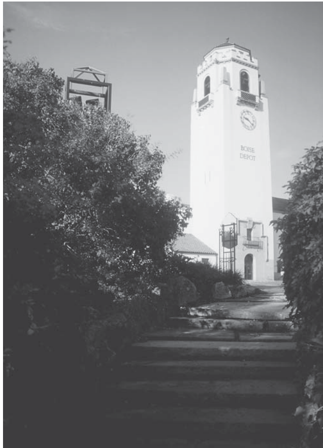
Boise Depot Tower