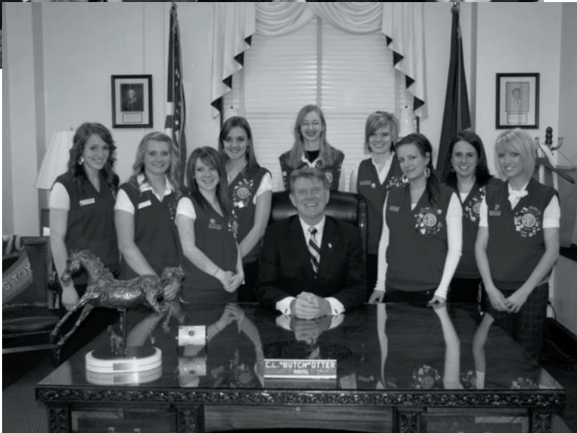
2009 Senate Pages with Governor C.L. 'Butch' Otter.