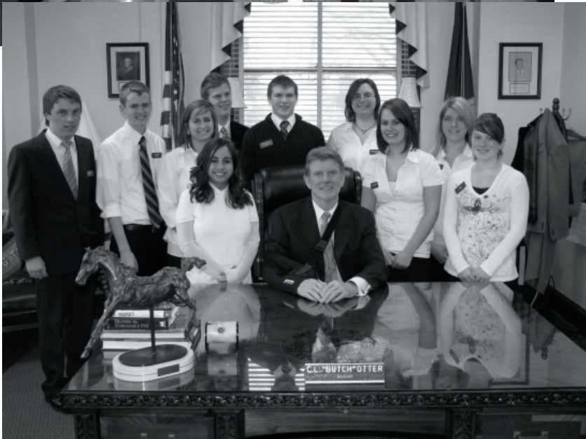
2009 House Pages with Governor C.L. 'Butch' Otter.