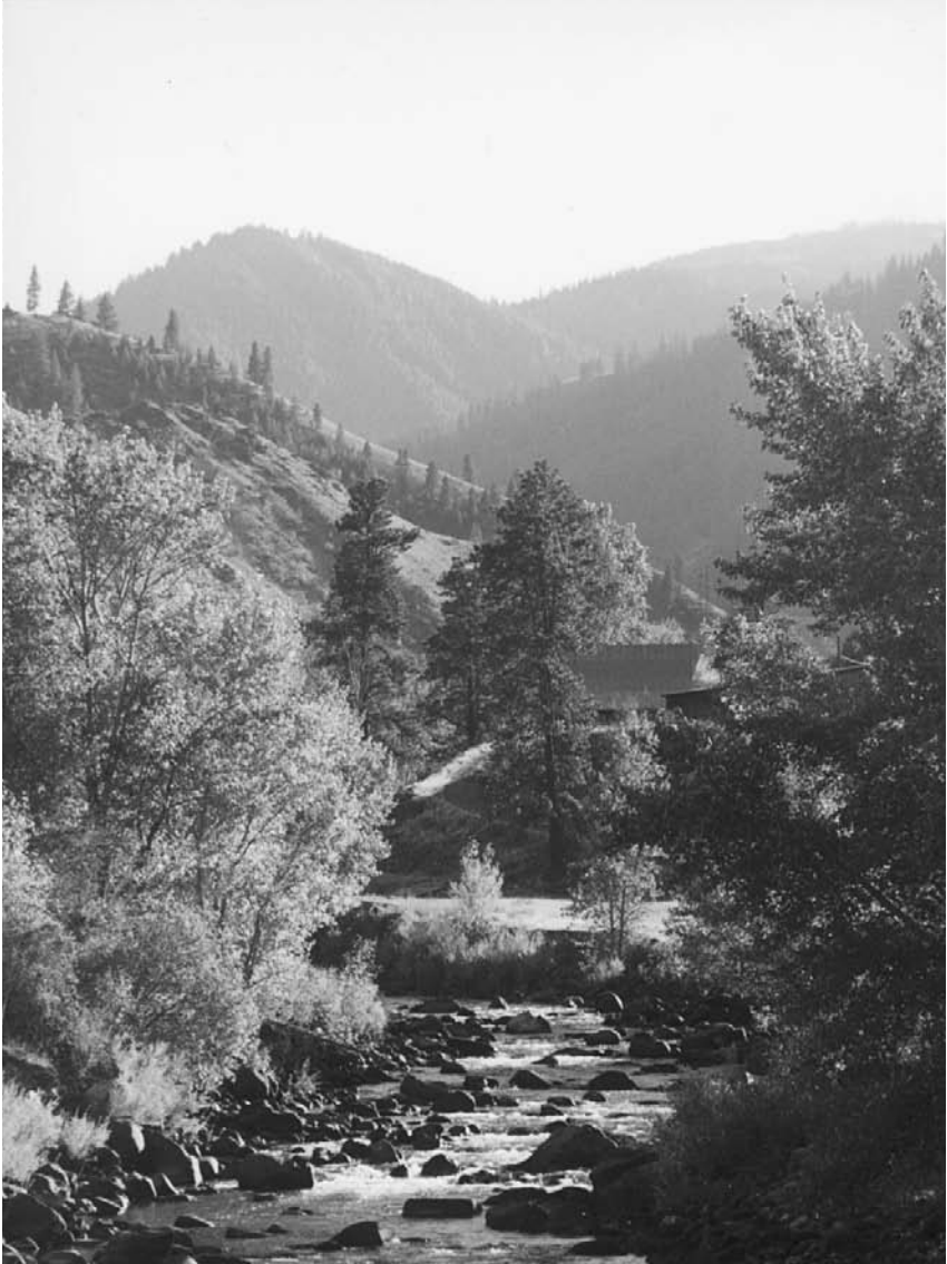
Little Salmon River south of Riggins in Idaho County