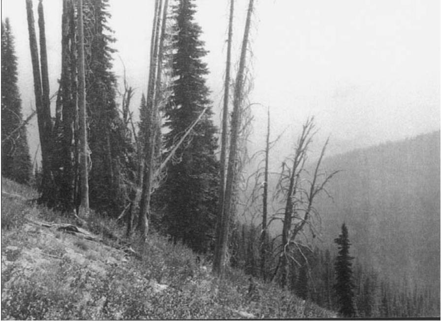
Along Lolo Trail