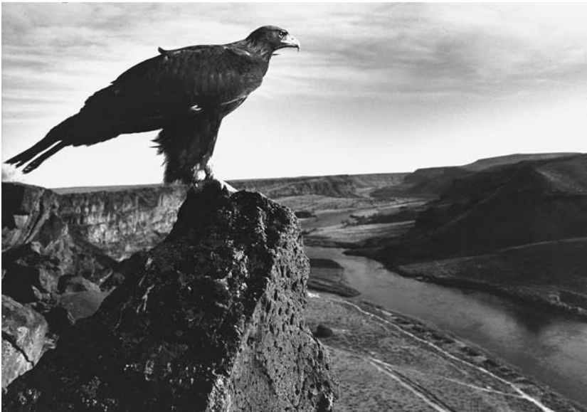
Eagle above Snake River