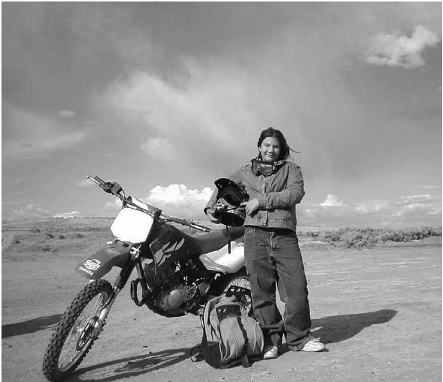
BLM land south of Boise is a popular destination for dirt bike riding.