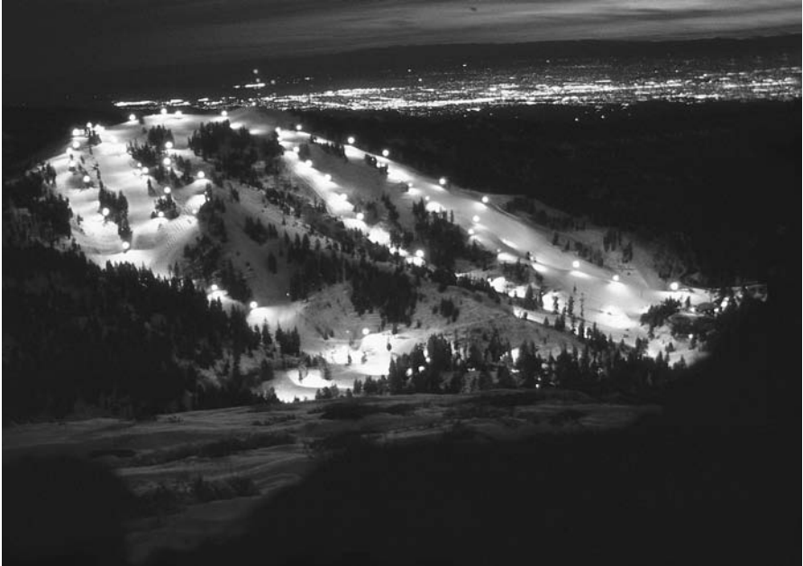
Aerial view of Bogus Basin Mountain Resort lit for night skiing.

Phone: 208-464-2311; Email: mskiles@orofino-id.com