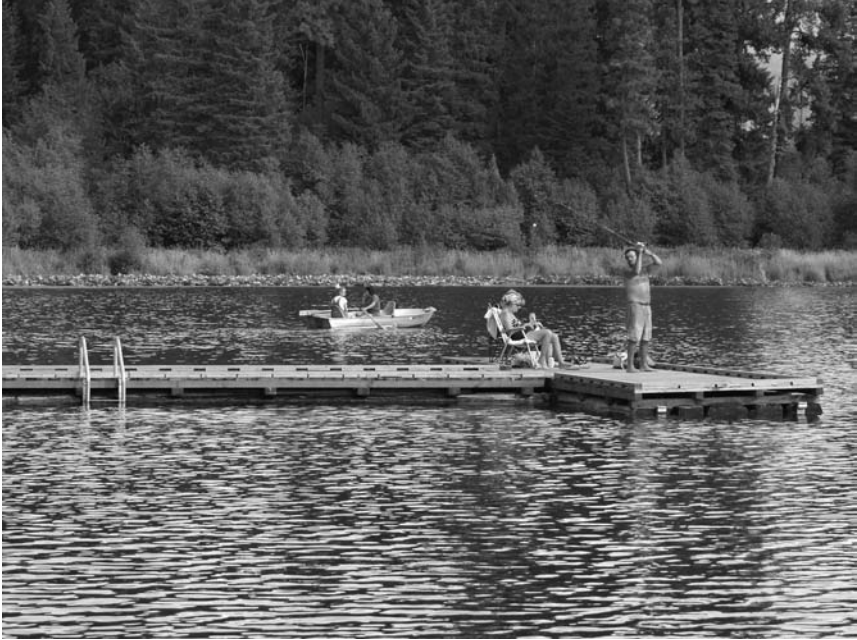
Round Lake Fishing Dock