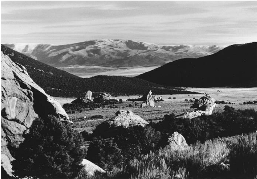
Silent City of Rocks