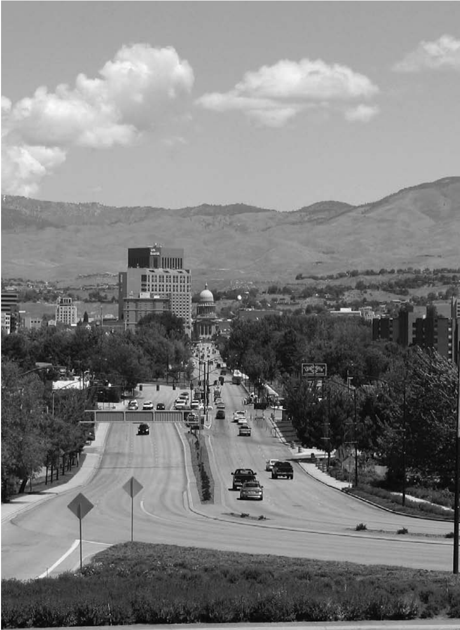
View of Downtown Boise from the Train Depot.