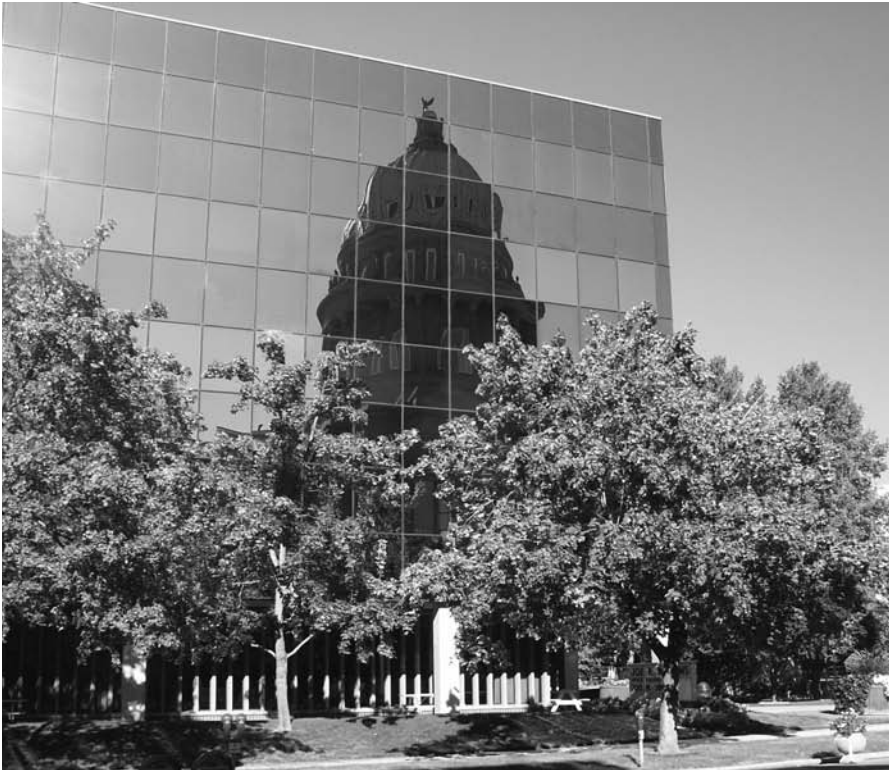
Capitol Reflection in Joe R. Williams Building