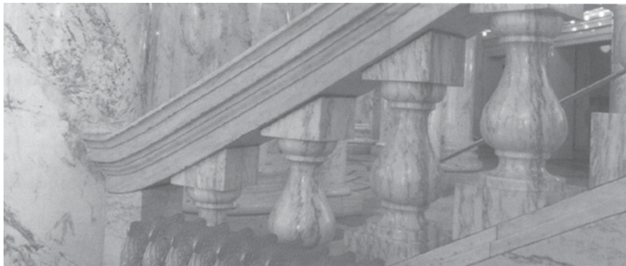
Capitol Interior Stairway

For additional information on the restoration of the State Capitol: http://www.idahocapitolcommission.org/