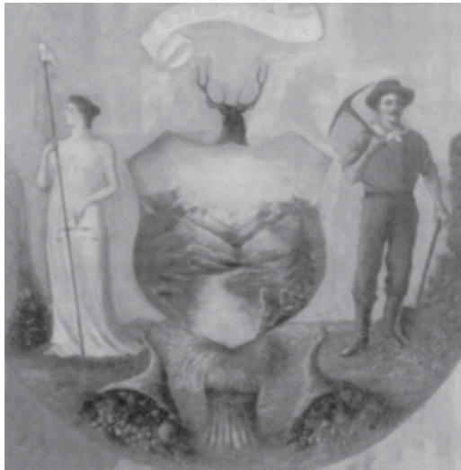
Original Great Seal Painting by Emma Edwards Green