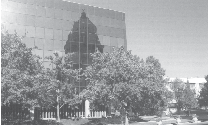
Capitol Reflection in Joe R. Williams Building

is 208 feet high. The original plans called for a flag atop the dome, but in the course of construction the eagle was substituted. The outside walls are faced with sandstone from state owned Tablerock east of Boise. Convict labor was used to quarry and deliver the sandstone blocks, some weighing up to ten tons. The shape of the sandstone blocks on the first floor resembles logs and gives the lower part of the building the appearance of a log cabin.