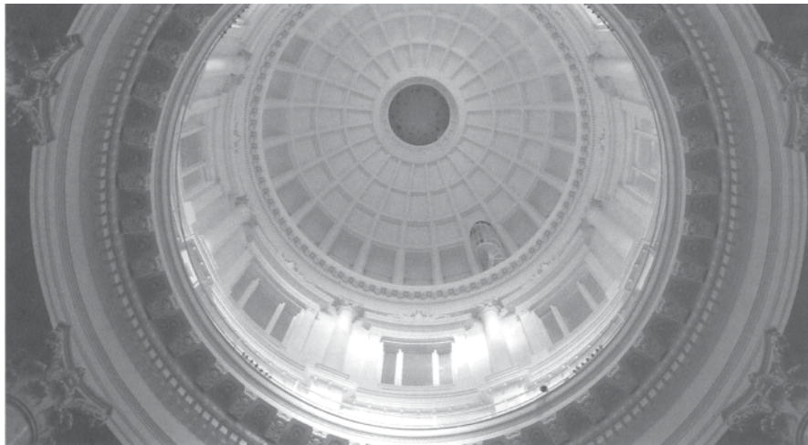
· Capitol Dome Interior

The building of red brick in the Norman style of architecture was finally completed in 1886. It measured 123' X 81' with five floors including the basement, but it had no indoor plumbing. It was used from 1886 to 1912