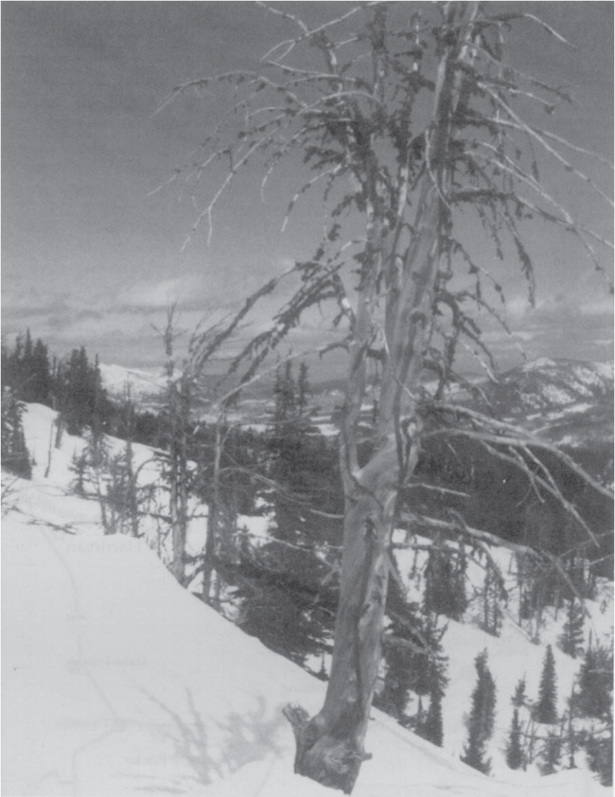
Bundage Mountain near McCall