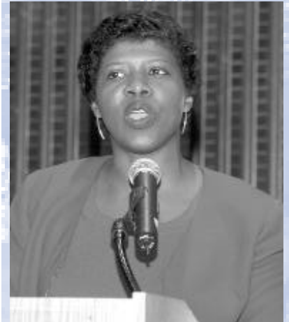
Gwen Ifill of The NewsHour with Jim Lehrer recounted the events leading up to the November election.