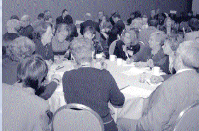
Roundtable discussions provided an ideal opportunity for networking among participants.