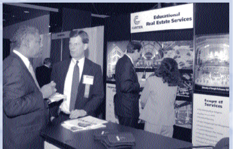
Exhibitors were kept busy by inquiring participants.