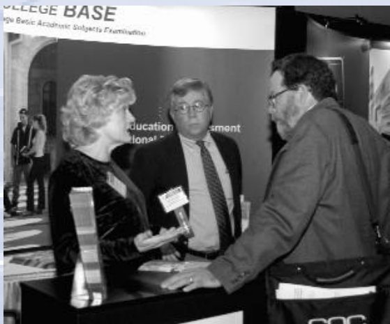
College BASE representatives discussed their assessment instruments with an interested attendee.