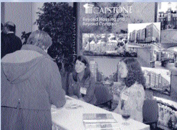
Exhibitors represented campus housing, bookstores, and food services; computer hardware and software; financial services; and assessment resource services.