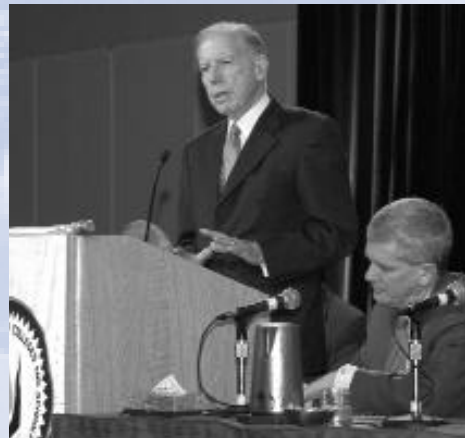
Former Governor William Winter of Mississippi delivered a dynamic speech on "Cultural Change, Community Building, and Civic Responsibility."