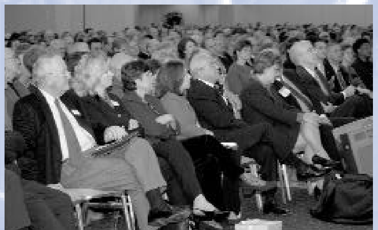
The audience was captivated by David Gergen's perspectives on the leadership attributes of former American presidents.