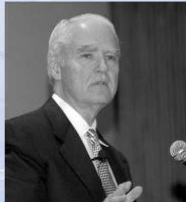
Chairman Donald Powell of the FDIC talked about ethics and integrity.