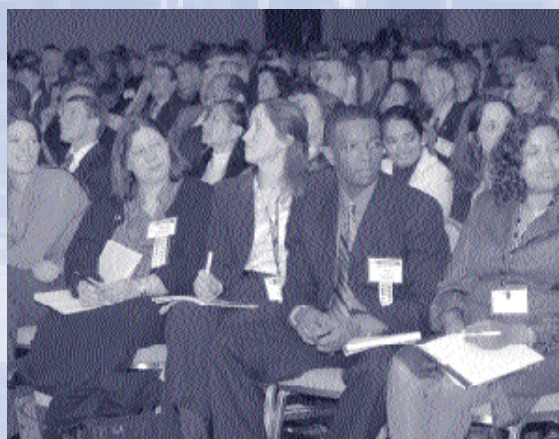
Graduate students who received travel grants are shown on the front row during the Opening General Session.