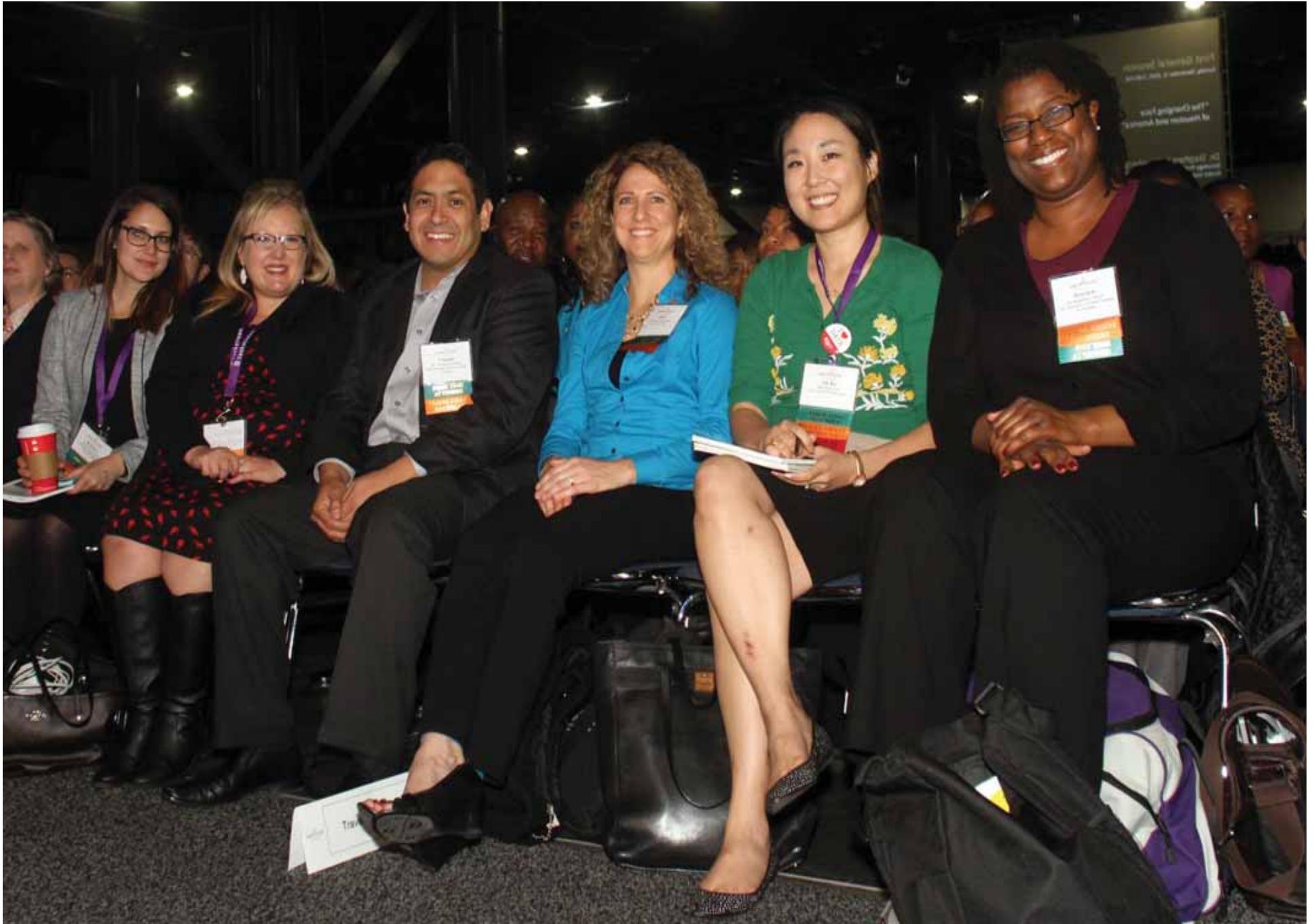
Shown are doctoral students who were chosen as a part of the SACSCOC Travel Grant program.