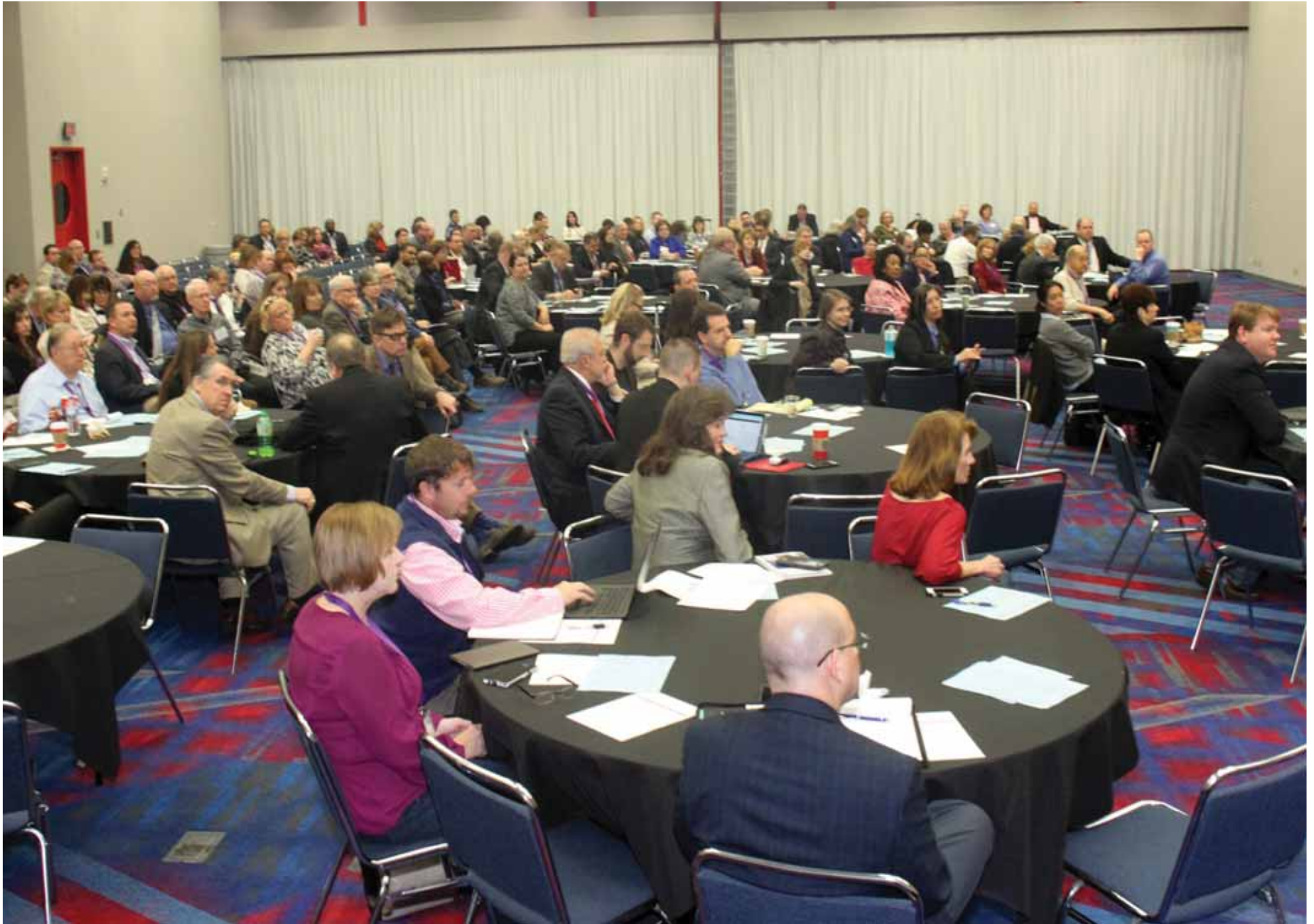
Some group meetings with staff were quite large.