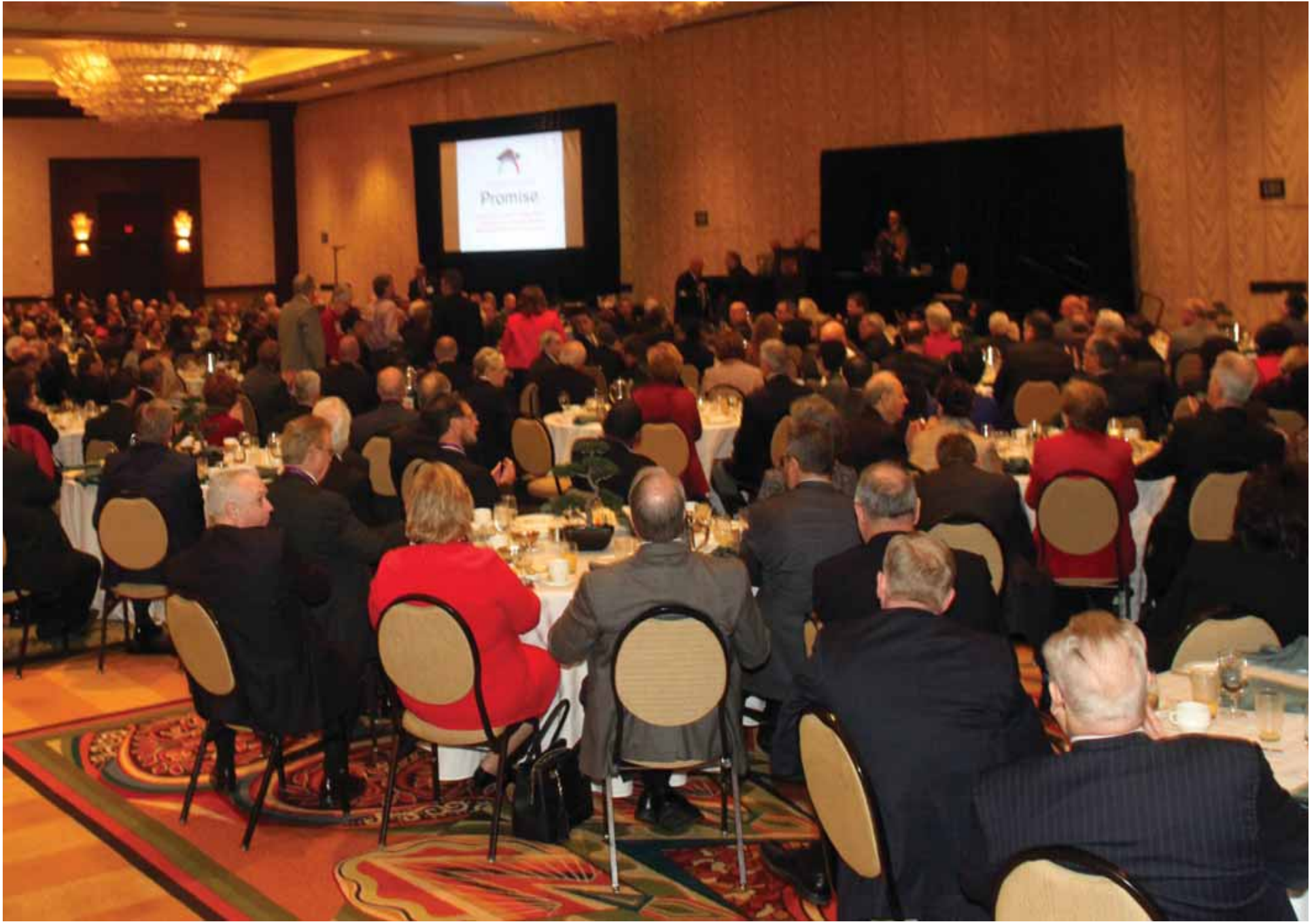
About 400 CEOs attended the Presidents' Day activities.