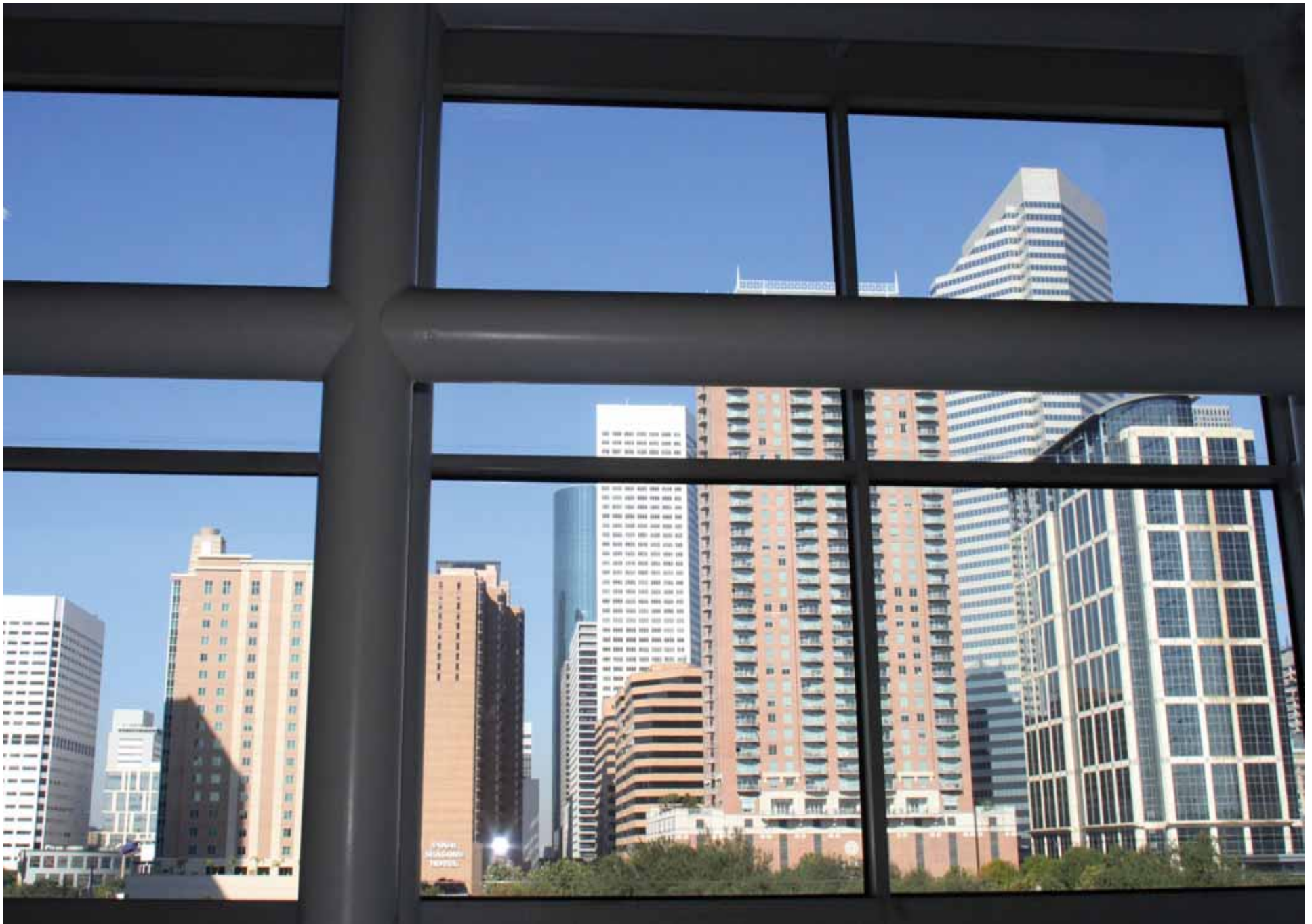
Houston, Texas was the site of the 2015 SACSCOC Annual Meeting . . .