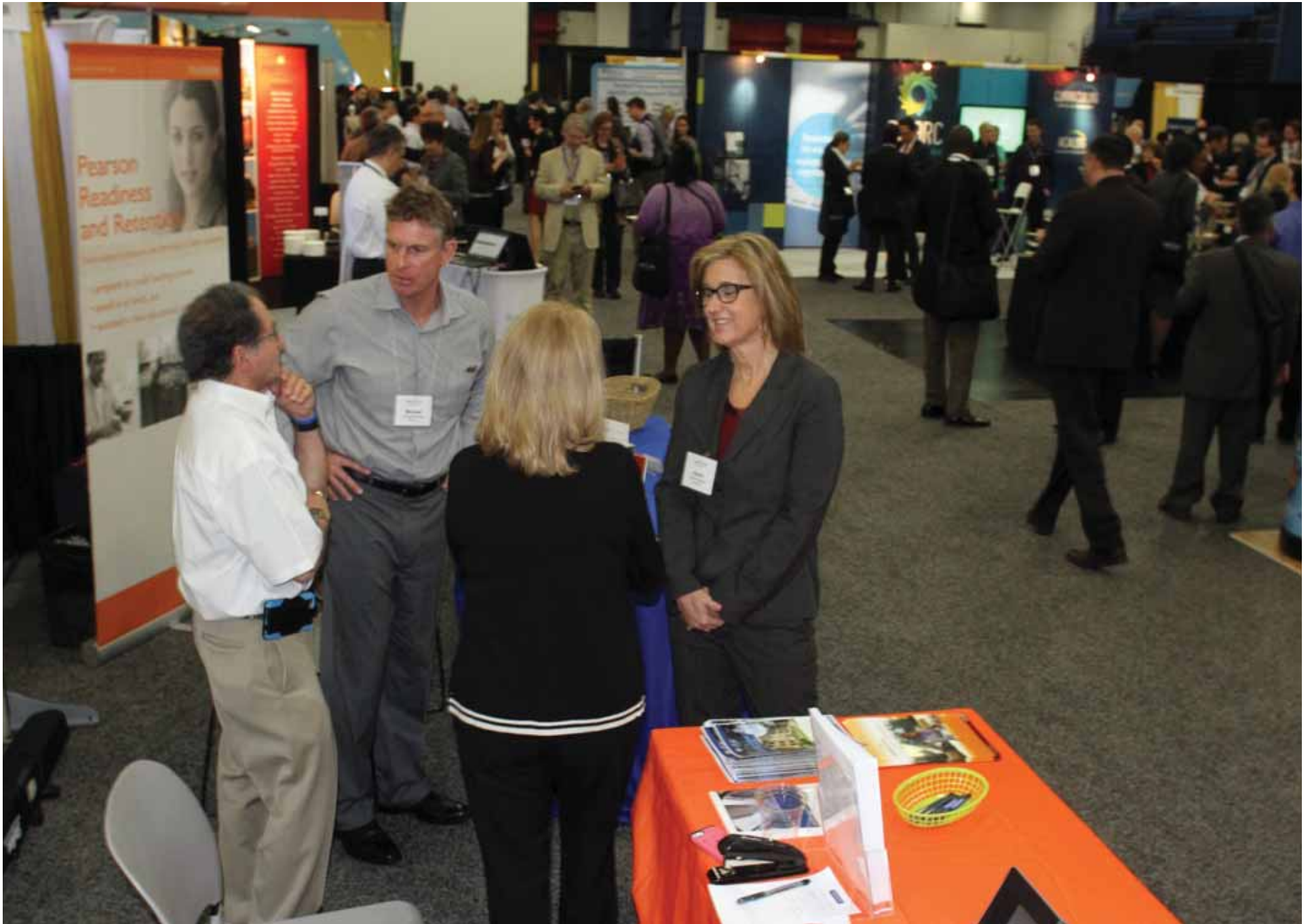
Many attendees spent time greeting old and new colleagues . . .