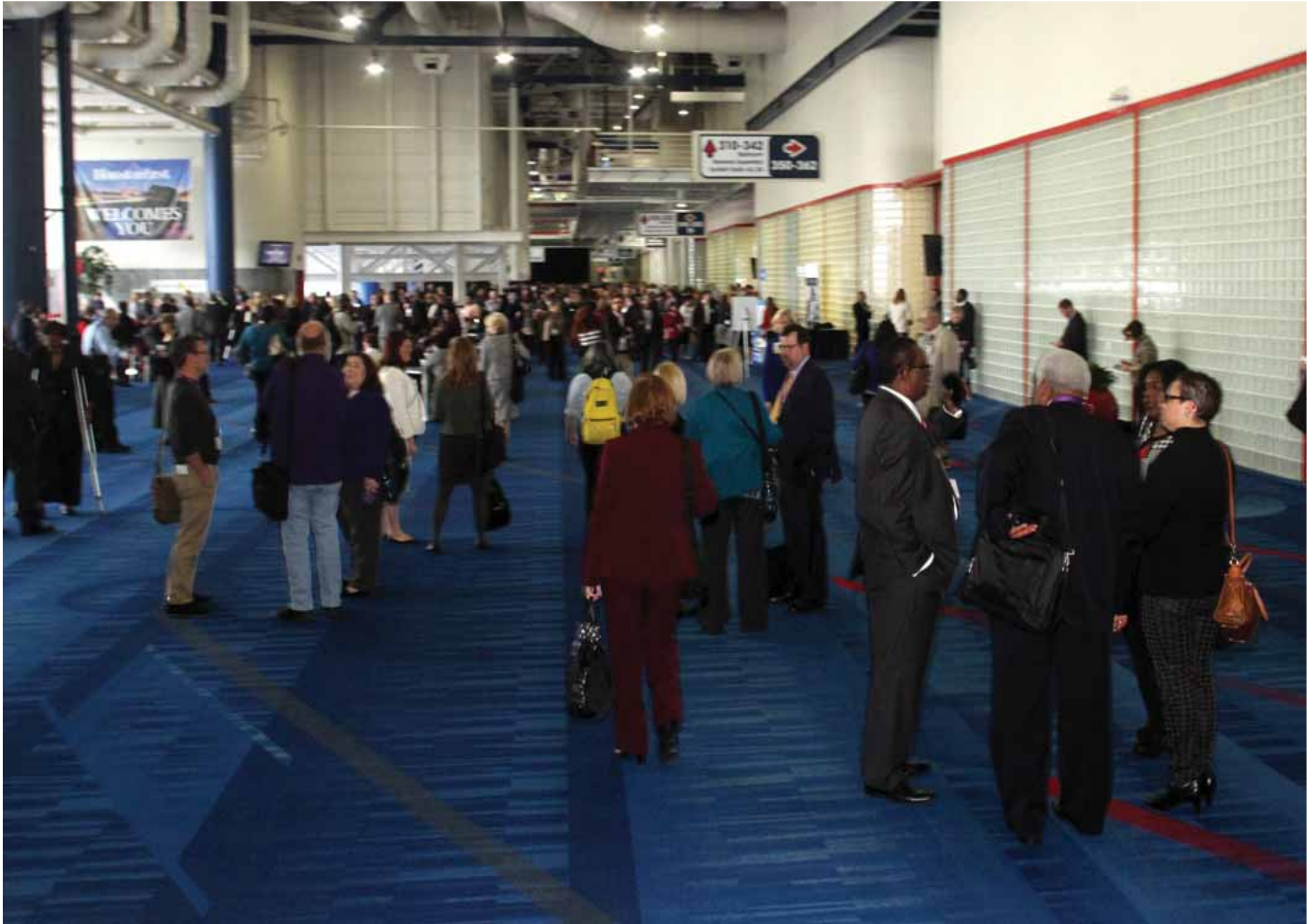
Networking is a major benefit cited by attendees at every annual meeting.