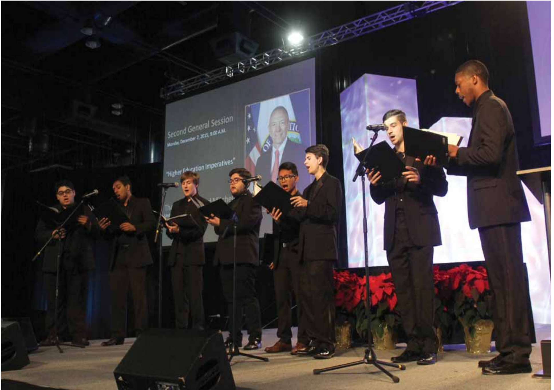
The Kings Men from Houston Baptist University provided music prior to the second general session.