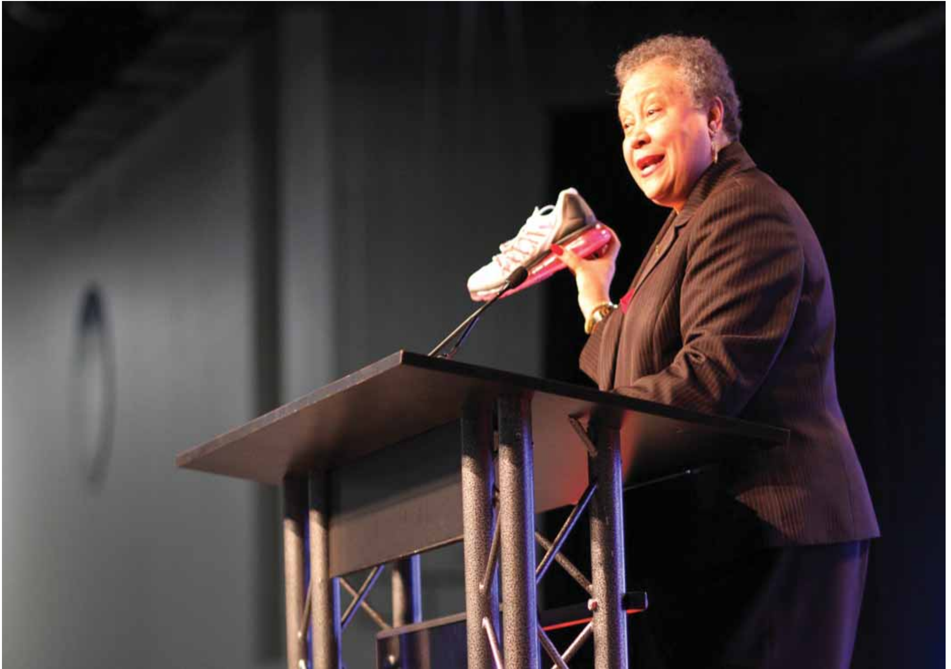
She encouraged everyone to consider comfortable shoes at the fourth largest convention center in the country.