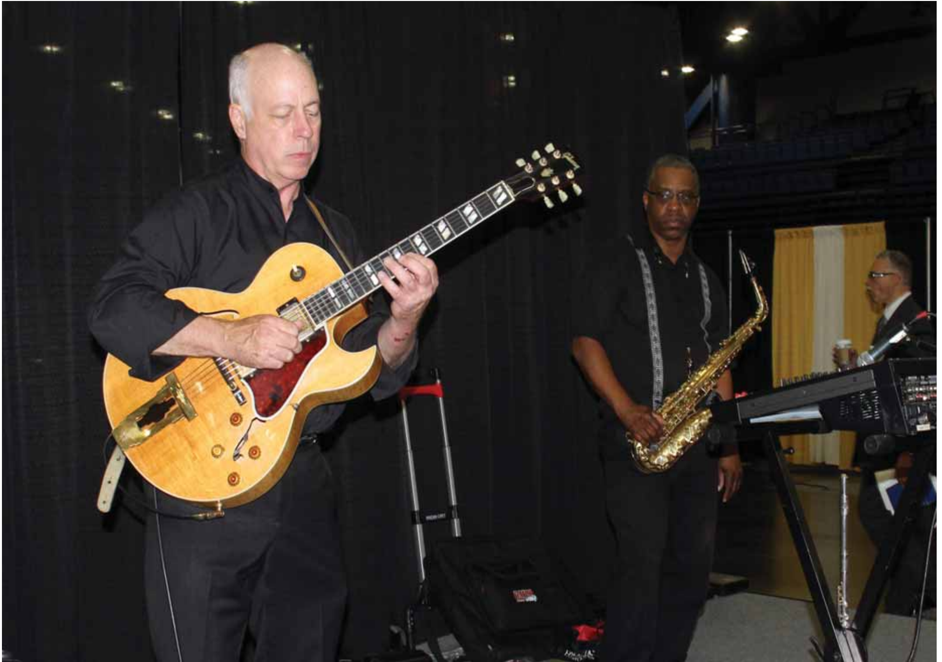
Music was quite good throughout the conference ... this duo performed during Sunday's opening reception.