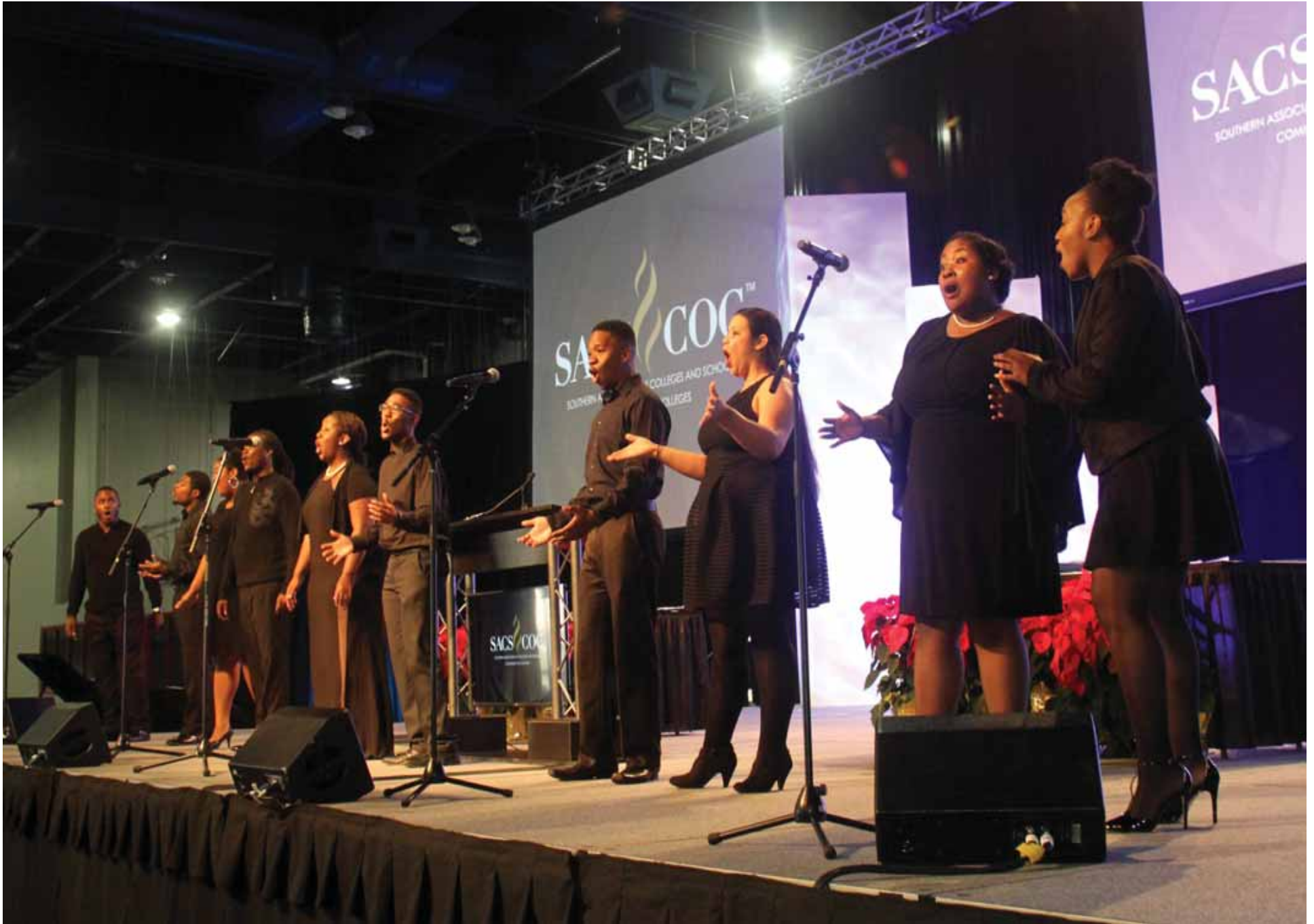
Texas Southern University's Heritage of Zion singers were upbeat and spirited.