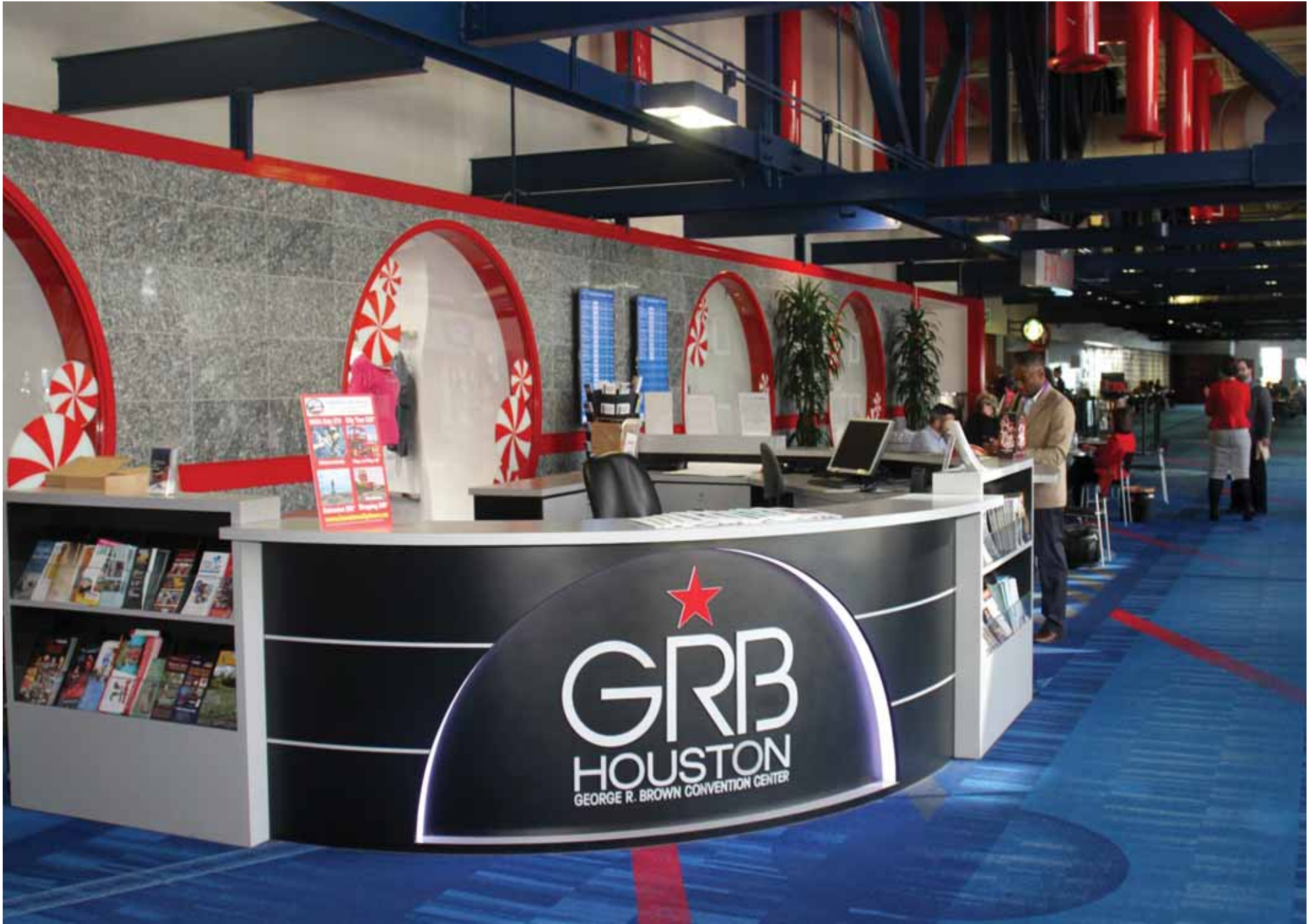
... specifically the George R. Brown Convention Center.