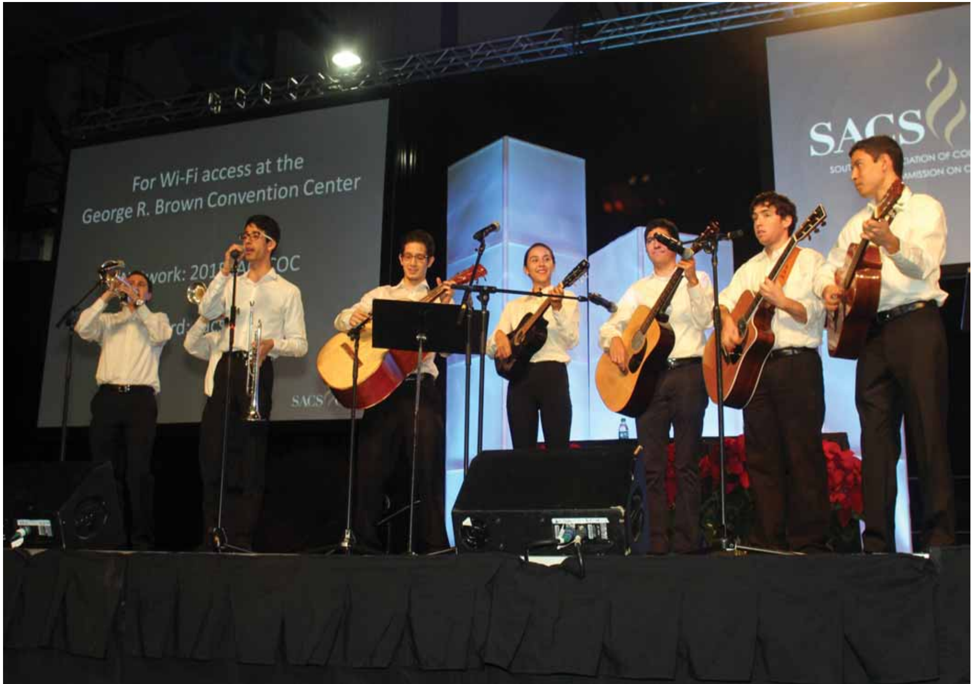
Mariachi Luna Llana from Rice University performed prior to the opening General Session .