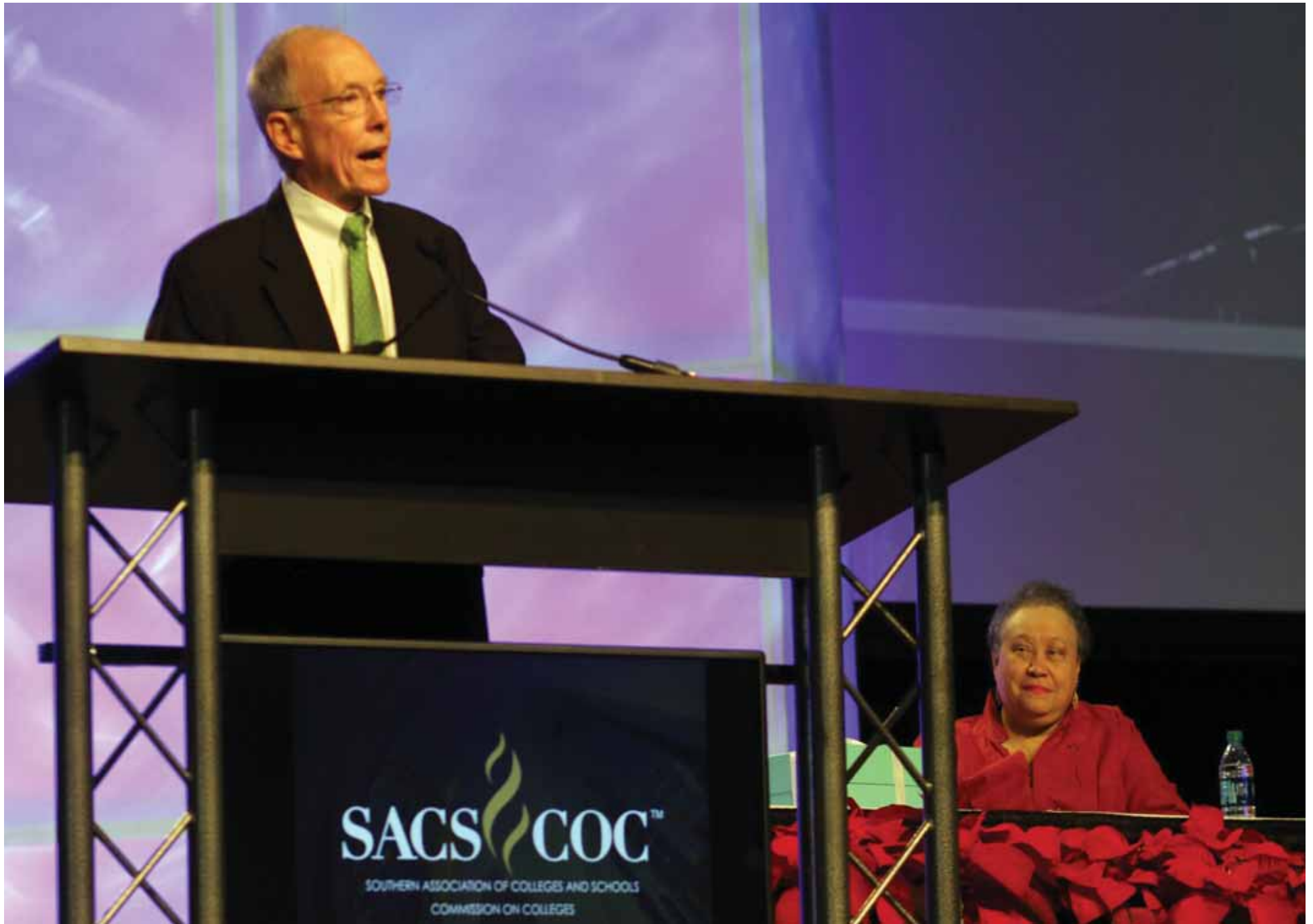
The Honorable Ted Mitchell, Under Secretary of Education, discussed a number of DOE imperatives.