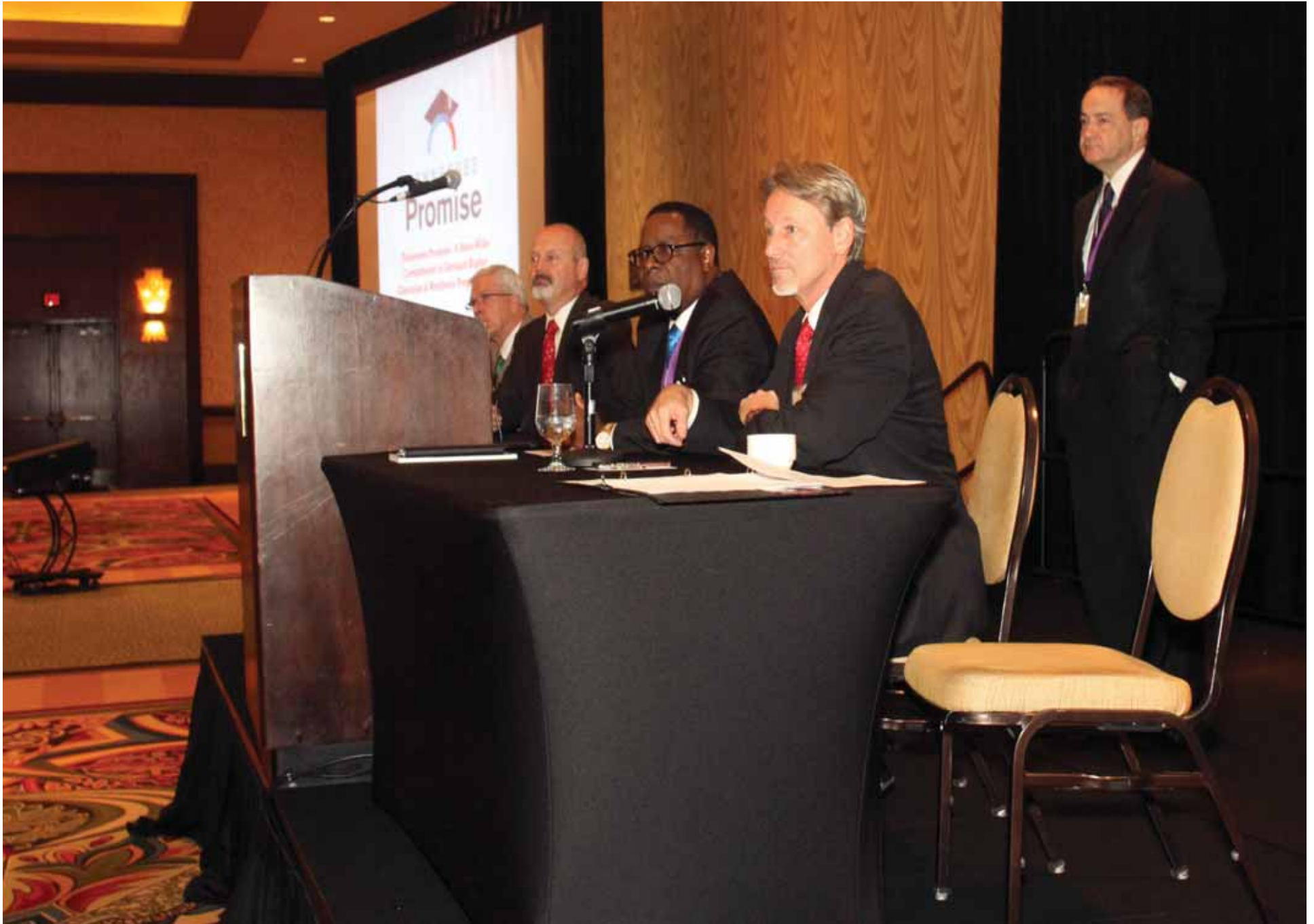
Tennessee Promise was the subject of an interesting panel discussion at the Presidents' breakfast.