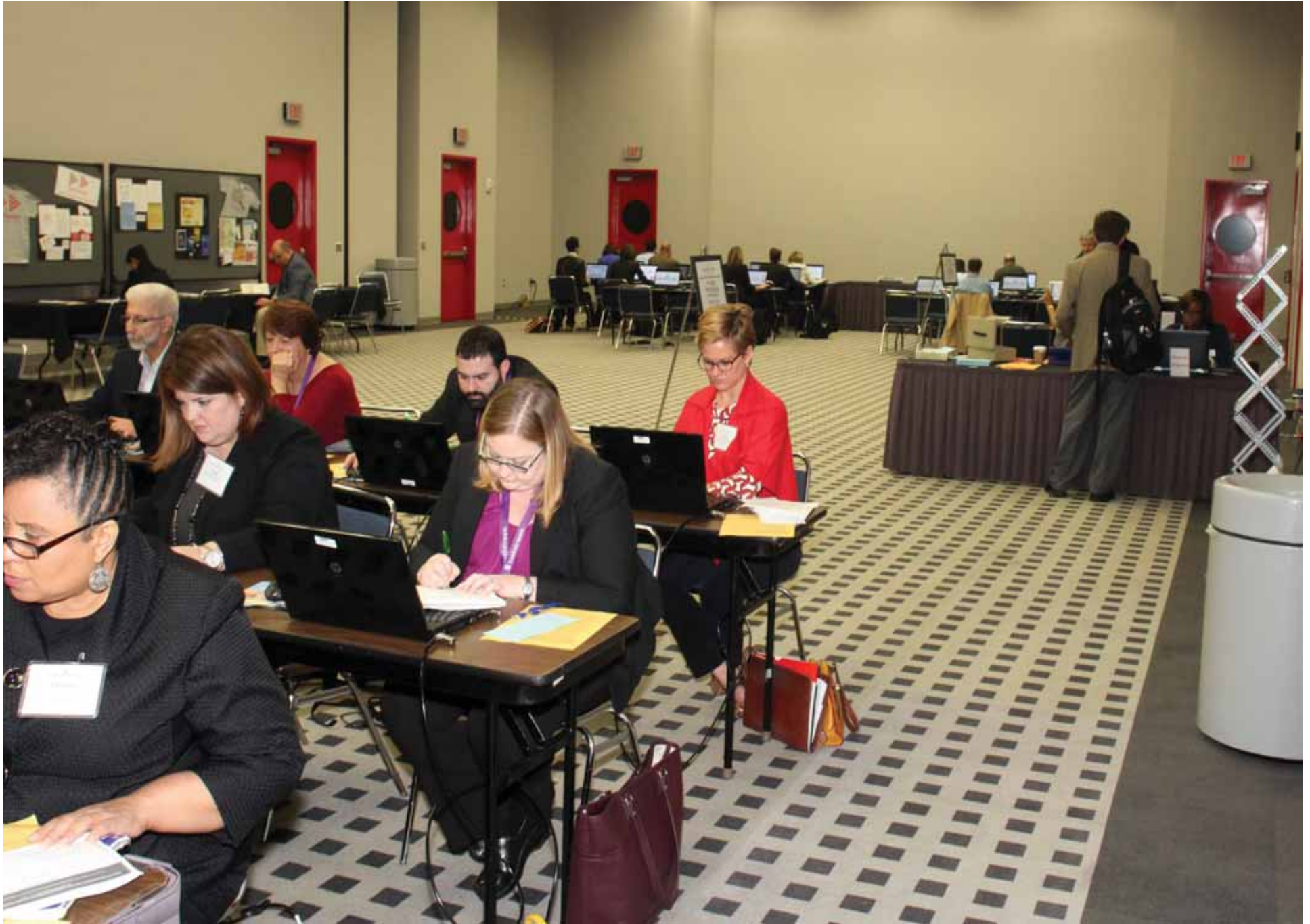
The Resource Room was also quite popular throughout the conference.