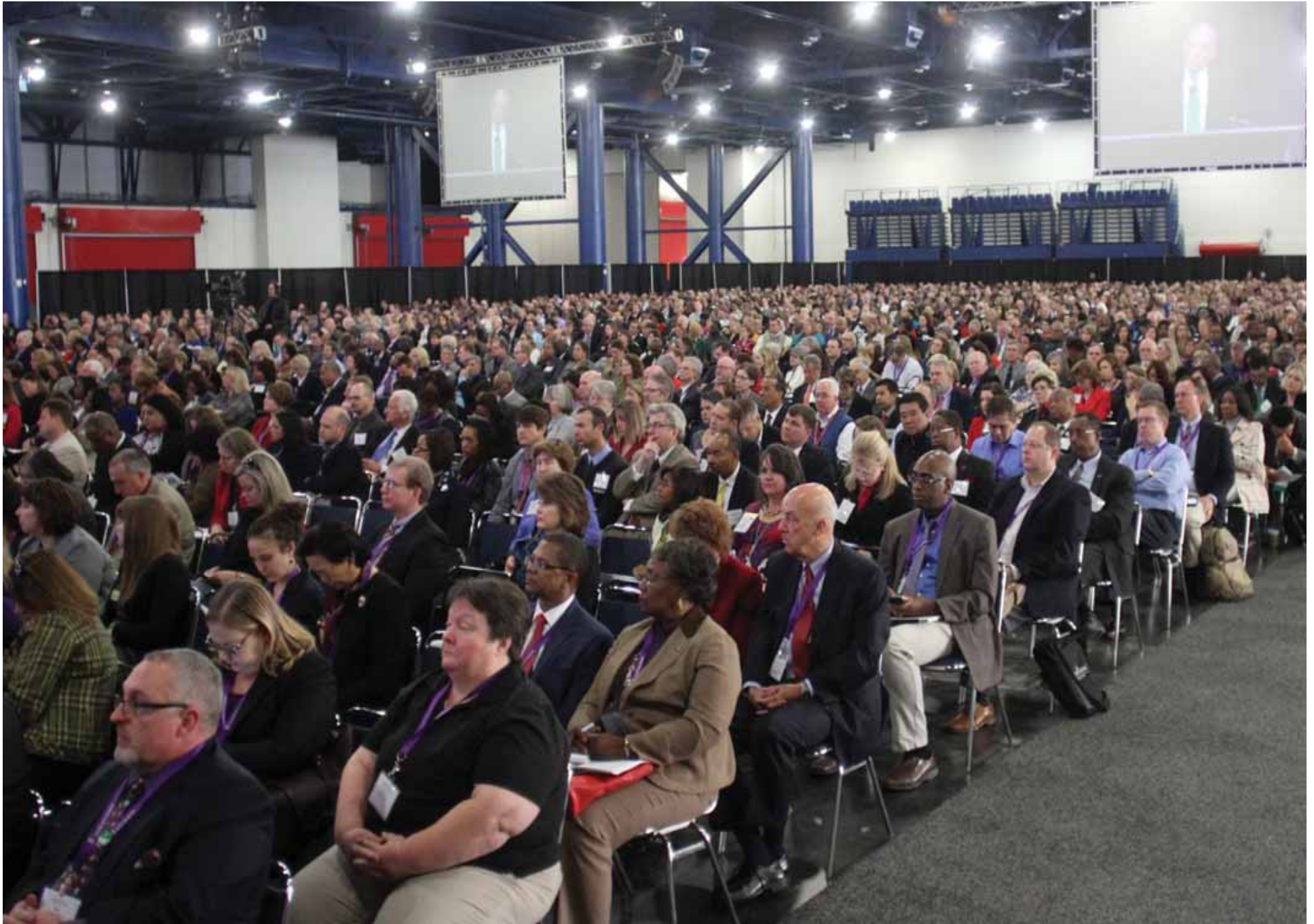
A total of 4,150 individuals registered for the 2015 SACSCOC Annual Meeting.