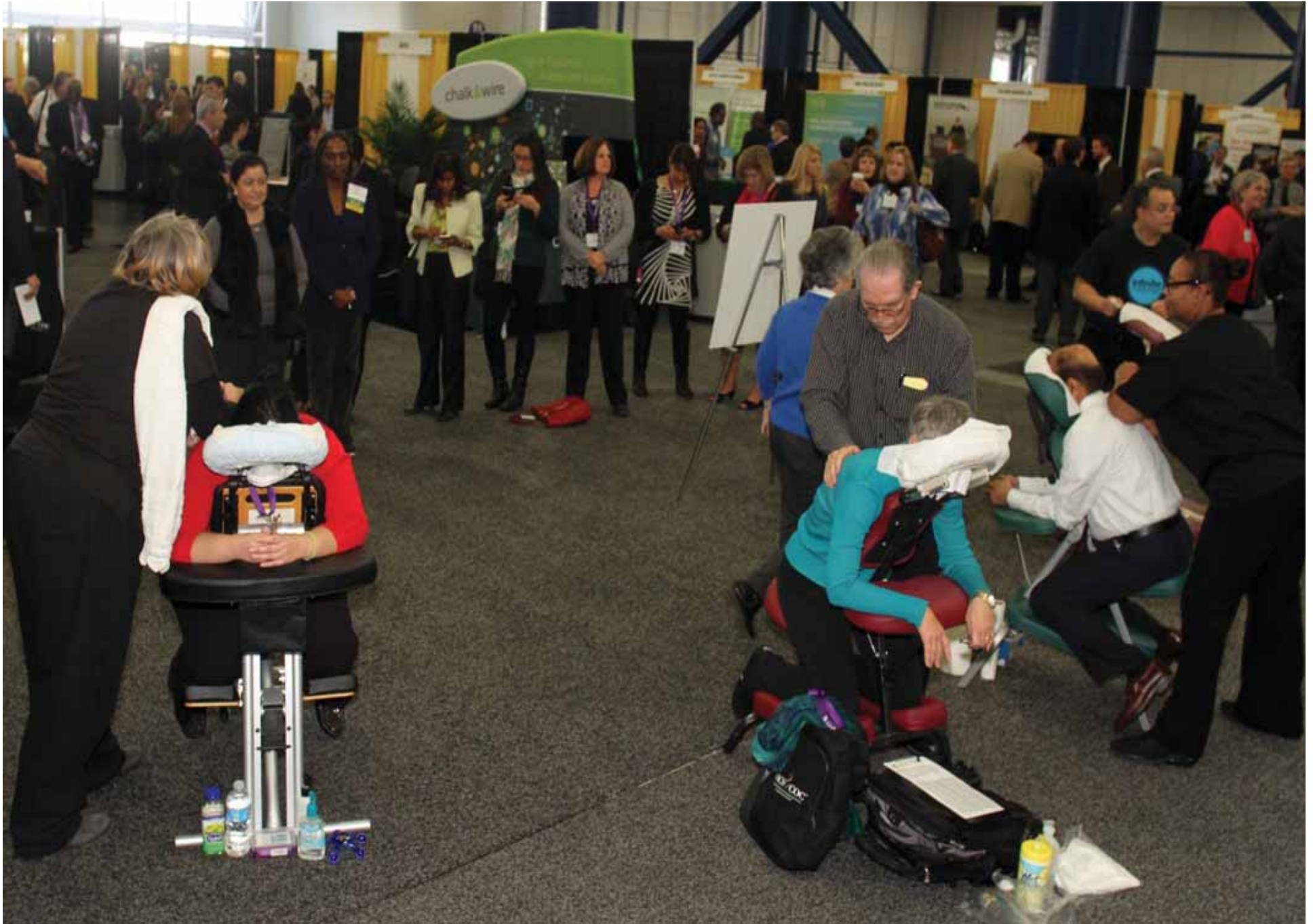
A relaxation station (sponsored by Livetext) was quite popular.