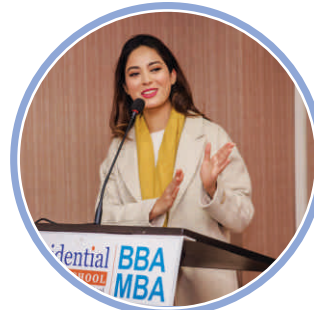
Shrinkhala Khatiwada Former Miss Nepal