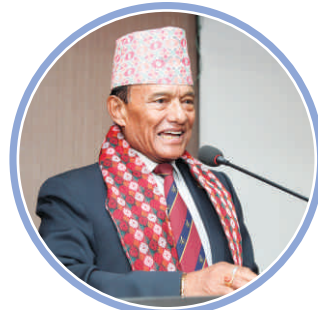
Rukmangath Katwal Former COAS