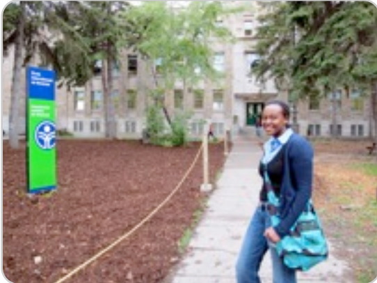
Shot 4: A portrait at eye level. If you want it to be anonymous try a close up of something that is important to you like a necklace, a keychain.