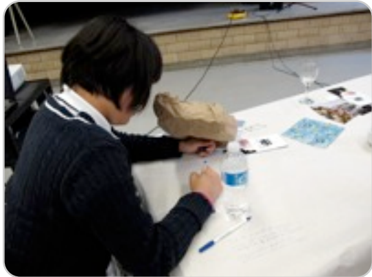
Shot 1: A high angle, over the shoulder medium shot (MS) of someone doing an activity.