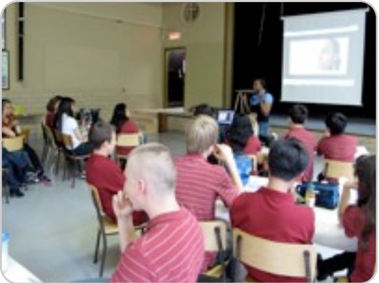
Shot 3: A long shot (LS) that describes the context of the activity.