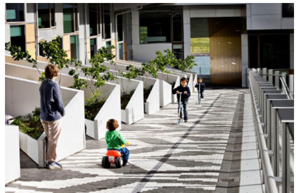
Not every unit in 8 House is exactly the same. 'No doubt it would be simpler to repeat the same apartment, but there is a quality in diversity,' Bjarke Ingels says. Image by Hayes Davidson TY Stange.