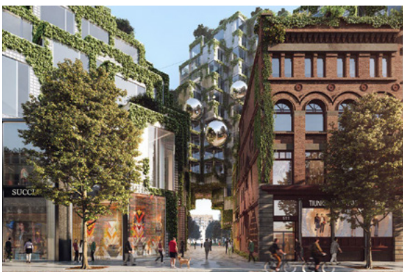
The development was inspired by Moshe Safdie's Habitat 67 in Montreal. Image by Hayes Davidson