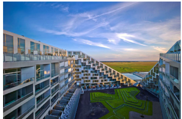
8 House, in Copenhagen's Orestad neighbourhood, was an earlier attempt by Bjarke Ingels to use the clustered building design that's now being brought to Toronto. Image by Jens Lindhe.

And yet even before all those trees grow in, the building will be distinctive and varied: terracing up and down, lifting up to create an arch over a pedestrian pathway. 'It is not just a giant rectangle,' Mr. Ingels says. Rather, it is deliberately intended as a device to create all sorts of social interaction.