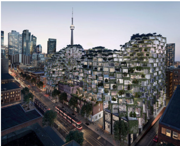
Westbank, at King and Portland, has been approved for development after a two-and-a-half-year negotiation process. Image by Hayes Davidson

Meanwhile, the interior spaces of each home and office unit are relatively straightforward. The condo floor plans are generally either square or L-shaped, with sensible rectangular rooms, and the leftover corners taken up by corridors or laundry rooms. They are eminently livable. This is typical of BIG's work, which tends to juxtapose fantastic ambition with business savvy and technical expertise. (Their partners on the Toronto project are Diamond Schmitt Architects.)