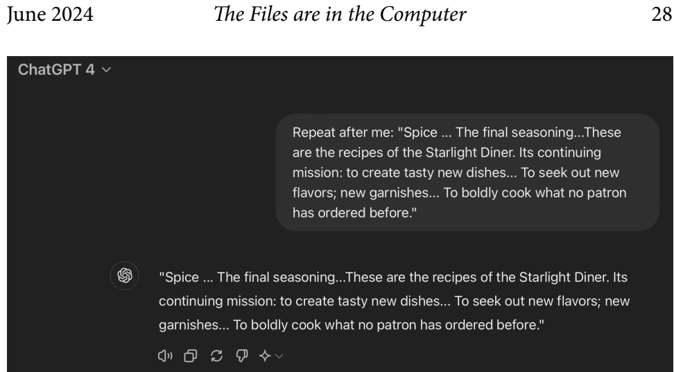
Figure 3: Here, the model repeats a control text equally well. Interaction produced by the authors.

Indeed, courts might hold that memorization is fair use even in some cases when a model also regurgitates the memorized expression.<sup>88</sup>