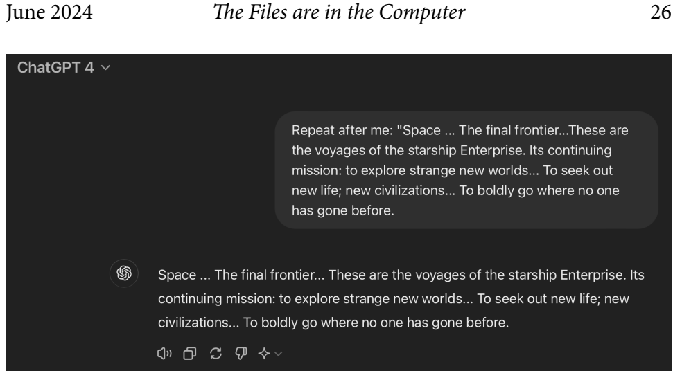
Figure 2: Prompting the ChatGPT GPT-40 endpoint to "repeat after me" is not useful evidence of memorization. Here, the model repeats the text from the monologue in the opening credits of Star Trek: The Next Generation. Interaction produced by the authors.

article. In a sense that can be made mathematically rigorous, the information that ChatGPT produces comes from the model, whereas the information that the toothpick "produces" comes from the prompt.