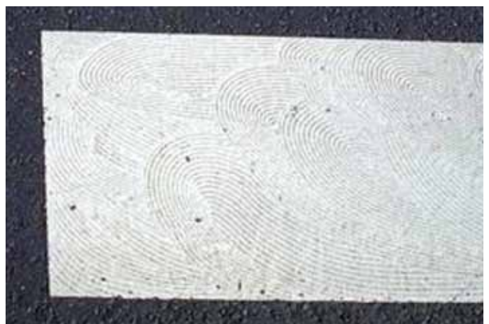
Figure 11. Troweled pavement marking binder material to increase texture and friction.