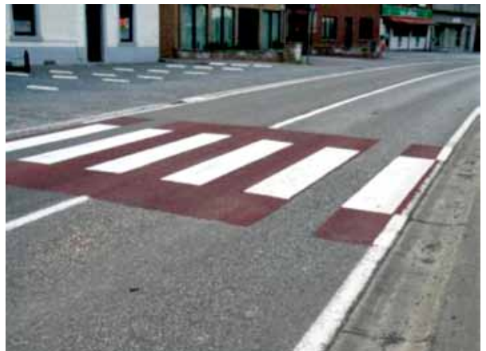
Figure 10. Gap left in crosswalk marking material for motorcyclist to pass through in Belgium.