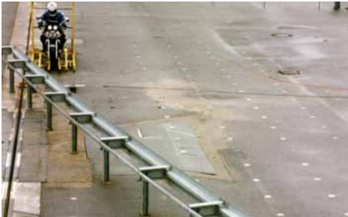
Figure 16. Upright motorcycle barrier impact test procedure.

as a crash black spot, open-graded asphalt mixes may be laid in that location. In England, high-friction surfaces were used at intersections. Some agencies had specifications limiting both the differential between adjacent pavement types and between the pavement and road markings because that differential causes grip problems for motorcycles.