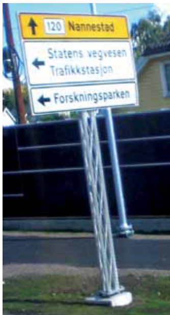
Figure 7. Lattice sign posts on a suburban arterial in Norway.