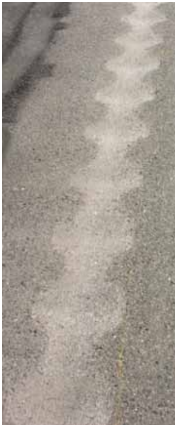
Figure 12. Centerline rumble strips with sinusoidal cut pattern to eliminate sharp edges that pose hazards to motorcyclists.

The team learned that the agencies it visited use the same roadway design philosophy as the United States, with a desire for design consistency within functional class and harmonization of posted speeds with design characteristics. In Europe, as in the United States, specific vehicle sizes and driver eye heights are assumed for roadway design values. The lack of a design motorcycle and rider was noted in several countries visited. Despite these data gaps, federal transportation agencies, European Union-sponsored coalitions, manufacturers' groups, and research institutes have developed the various roadway design guidelines described in this chapter.