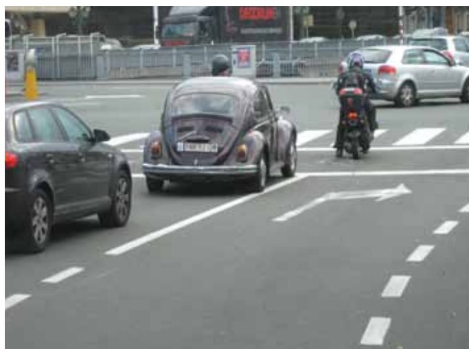
Figure 9. Advanced stop line with queue-jumping designated lane (dashed line) for bicycles, but often used by powered two-wheelers in Brussels.