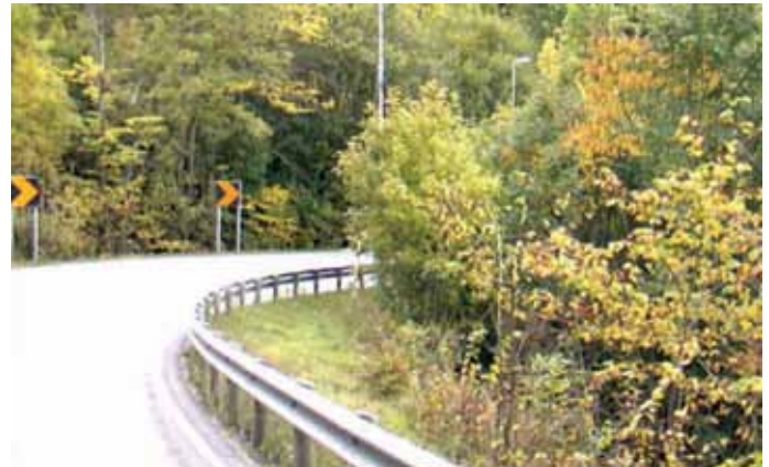
Figure 18. Norwegian Vision Zero Motorcycle Road before treatment.