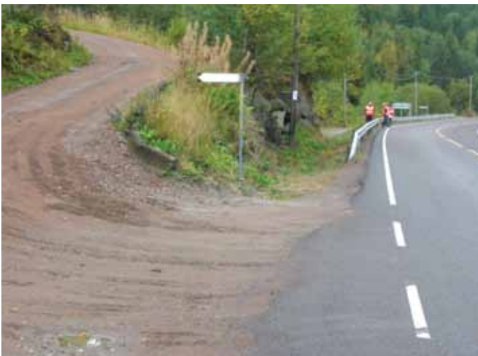
Figure 5. Before: gravel and dirt from side of road washed onto paved roadway.