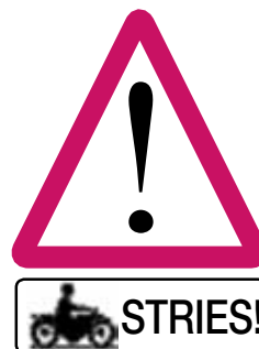
Figure 3. Work zone caution sign in Belgium with supplemental motorcycle plaque warning of grooved pavement (stries = striations).

benefit to motorcyclists because of their relative vulnerability to injury compared to automobile passengers. For instance, the Norwegian maintenance handbook has sections on clearing roadside obstructions that pose crash hazards and limit sight distance. This practice helps all road users, but can particularly benefit motorcyclists. Two unique maintenance practices organized by stakeholder groups were presented that could be adopted in the United States. One was a “road quality ride” organized by a rider group in Belgium, during which local motorcycle clubs ride together on a specific road to inspect and report on pavement quality and pick up debris and litter on the shoulder. The other was a roadway condition reporting system, either phone- or Web-based, aimed specifically at motorcyclists. Implementation of these systems varied from country to country. In Norway, for example, the Motorcyclists Union maintained a reporting