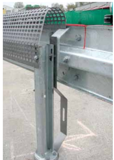
Figure 15. Above: System Euskirchen Plus guardrail, which includes a bottom skirting and a cap along the top; right photo shows alternate cap design.