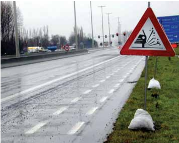
Figure 4. Splash warning sign in a work zone in Belgium.

Several agencies reported that sign post removal, either through consolidation of signs onto one post or relocation behind a barrier, was one strategy to provide a more forgiving roadside for motorcyclists. In several countries, the team observed lighter weight lattice sign posts, which were believed to be less of an injury threat to motorcyclists (see figure 7).