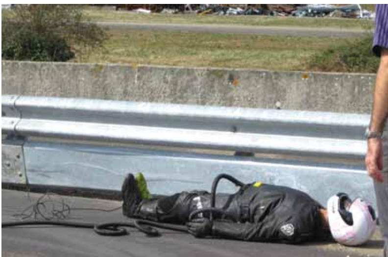
Figure 14. Motorcycle barrier and crash test dummy at LIER in Lyon, France.

These motorcycle-friendly barrier designs have been installed widely in some countries and in a limited way in other areas. France was conducting a large before-and-after crash outcome analysis of its installed barriers, which was expected to be completed in 2012. Spain conducted a crash-causation study in 2007 that included some analysis of guardrail crash types. 9 An earlier European Union-sponsored study on advanced protective systems also included some analysis of crash barrier types. 10