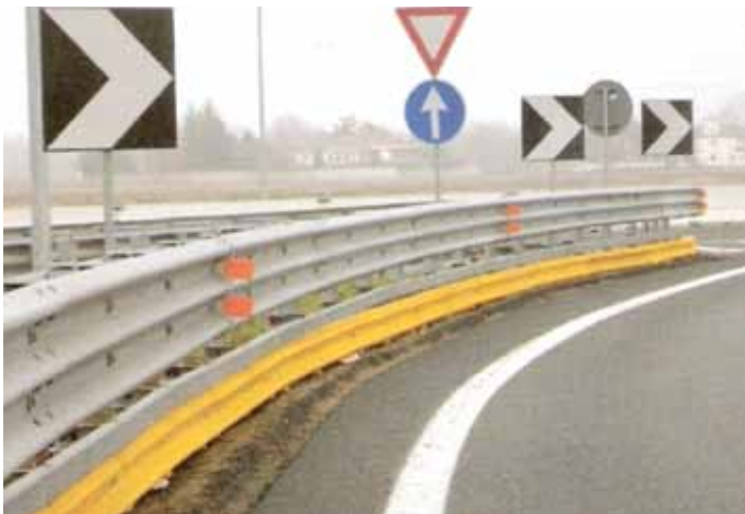
Figure 17. Spanish guardrail that meets motorcycle safety standards.