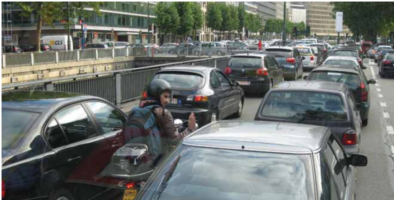
Figure 2. A scooter rider filtering through urban traffic in Brussels.

cle parking areas on surface lots, and allowing multiple PTWs in a single automobile parking space.