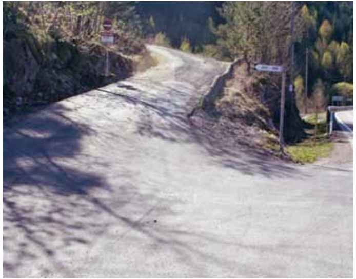
Figure 6. After: 5 meters of driveway paved with asphalt at intersection with paved roadway.