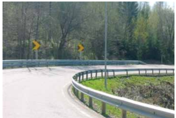
Figure 19. Norwegian Vision Zero Motorcycle Road after brush clearing and installation of motorcycle barrier on outside of curve.