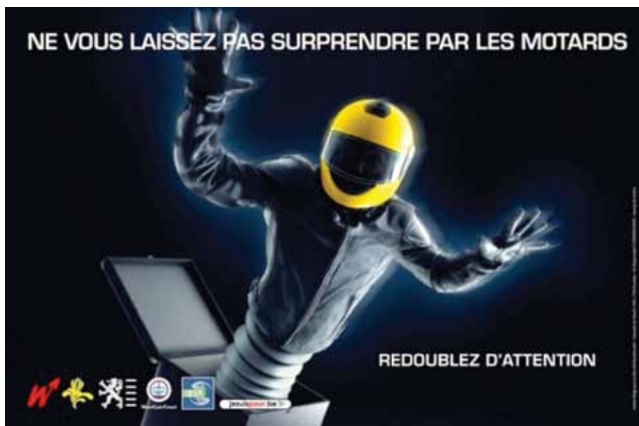
Figure 20. Belgian traffic safety poster: "Do not let yourself be surprised by the bikers. Be doubly careful."

In each of the countries the team visited, cooperation between motorcycle rider groups and government agencies was strong. The Federation of European Motorcyclists' Associations (FEMA) represents 19 countries' rider groups. Its mission is to raise awareness of motorcyclist issues with the European Union and agencies of the United Nations. FEMA has been instrumental in promoting roadside barrier safety testing and regulations as well as roadway design and traffic engineering standards. It also promotes rider safety education programs. Most program materials are published in an English version. Appendix D lists resources to access this material.