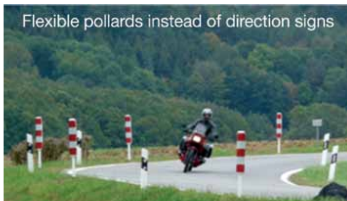
Figure 8. German example of curve delineation with flexible post delineators.

Pavement marking material choices and application practices are discussed in the Belgian Road Safety Institute document on motorcycle considerations for motorcycles. It recommends textured pavement markings by troweling or using antiskid particles mixed in with retroreflective elements.