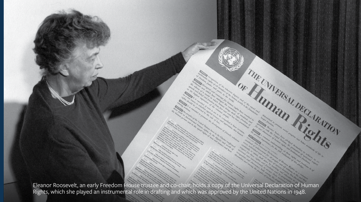
Eleanor Roosevelt, an early Freedom House trustee and co-chair, holds a copy of the Universal Declaration of Human Rights, which she played an instrumental role in drafting and which was approved by the United Nations in 1948.

Freedom House was founded in 1941 to mobilize policymakers and a broadly isolationist American public to engage in the fight against Nazi Germany and the fascist threat to American security and values. In the decades since, Freedom House has established itself through its advocacy, programs, and research as the leading nonpartisan American organization devoted to the support and defense of freedom around the world.