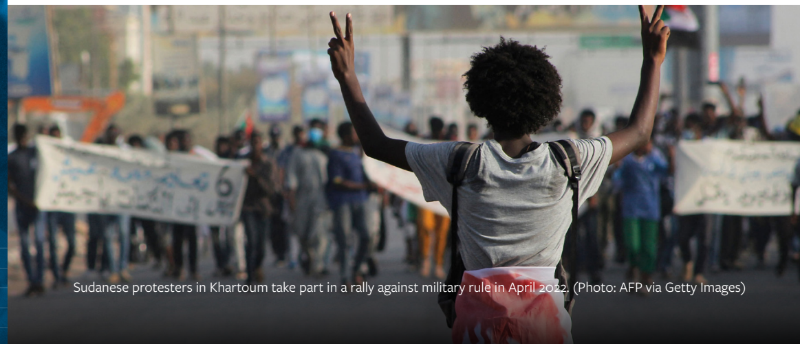
Sudanese protesters in Khartoum take part in a rally against military rule in April 2022.

Freedom House advocacy helped lead to the passage and reauthorization of the Global Magnitsky Human Rights Accountability Act, one of the world's strongest tools to punish the worst human rights abusers and perpetrators of corruption. It has been used to freeze the assets and prohibit entry of more than 475 individuals and entities in more than 40 countries.