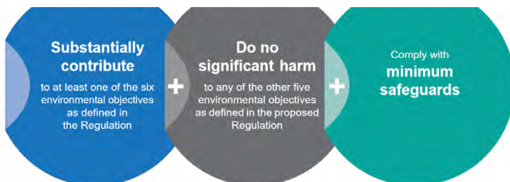
EU Taxonomy process for identification of a green activity

Note that steps 2 and 3 above are not within the scope of the CGT as presented in this document.