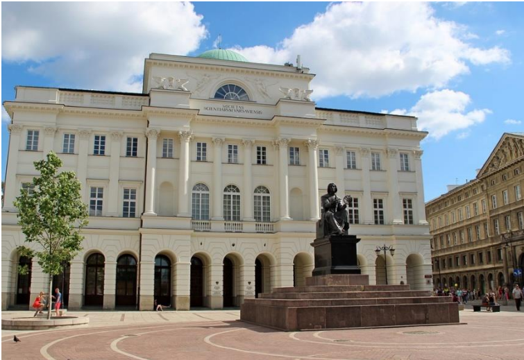
Polish Academy of Sciences in Warsaw

In Poland there are ca. 400 higher education institutions, 79 Polish Academy of Sciences establishments and around 120 public research institutes and laboratories, which focus their activities on conducting applied research and development activities.