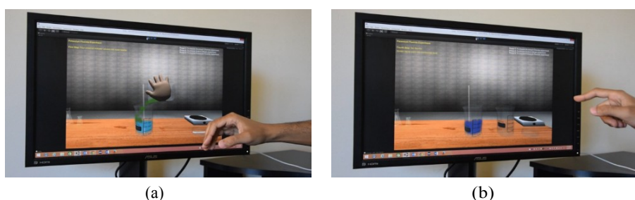
Fig. 1: A student using the haptic system (a) The student pouring the universal indicator solution into the water beaker; (b) The student tapping the screen remotely using the Leap Motion to move to the microscopic level.

The objective of this lab is to study the change of three different types of salts when they are added to water, chemically called Salt Hydrolysis. Our system allows the user to select one of three different types of salts - ammonium chloride salt, sodium nitrate salt or potassium fluoride salt. Each one of these salts gives a different result when they are added to water. At the macroscopic level of the system, the user completes the experiment steps using the haptic device and then the change can be observed in the mixture's appearance as in a real lab. The chemical explanation of this change can then be discovered by moving to the microscopic level which can help deliver a better understanding of this chemical reaction.