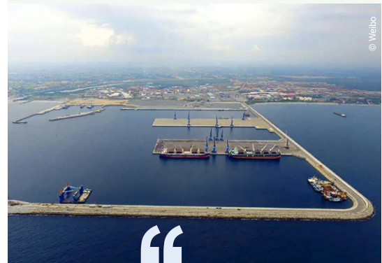
Commercial port in Bata, Equatorial Guinea

The ASYCUDA Project is expected to help improve the nation's economic and financial governance.