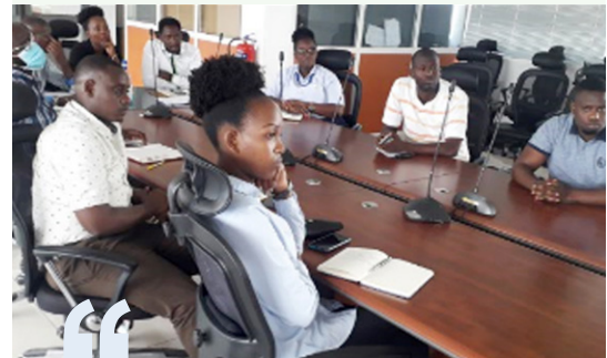
ASYCUDA Training to Customs Officers in Bujumbura

There will be no more waste of time, no more back and forth, no more endless discussions and arguments between declarants and customs officers.