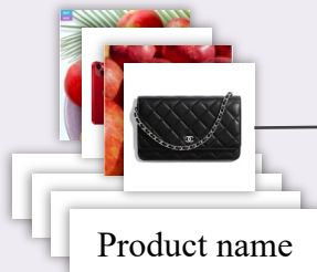
Image Transformer Encoder