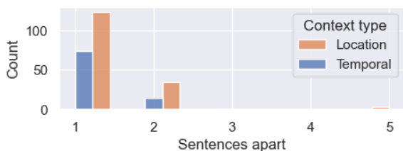
Figure 2: Number of sentences between the relevant entity/event and its corresponding context.

A key aspect of the dataset is the presence of annotations for inter-sentential relations—i.e., relations where the event/concept of interest and its scenario context are in different sentences. These comprise 18% of scenario context relations. Approaches that rely on syntax, e.g., SRL, are not well suited for inter-sentential relations. Figure 2 shows the distribution of sentence distances for the inter-sentential subset of annotations.