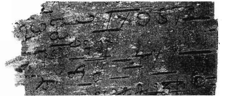
Fig. 8. Likhidago notation written in small letters between lines of text (Frag. 2): sarva ime avadana [aca] (*likhidaga) .