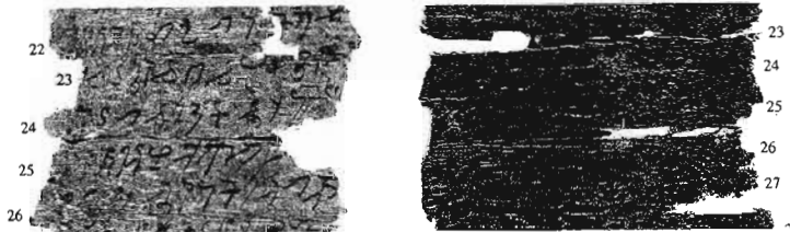
Fig. 5. Story numbering in Fragments 16 + 25: number 1 (!) in l. 23 and number 2 (!) in l. 27.