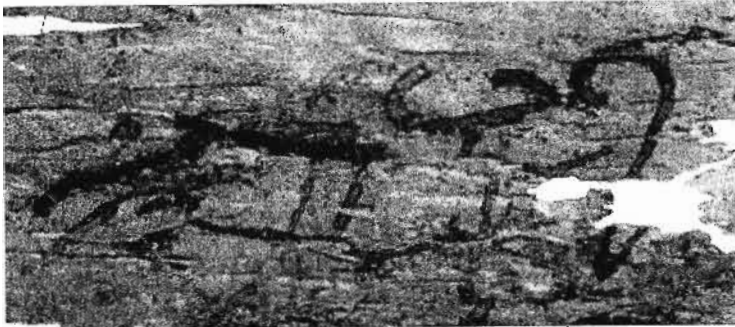
Fig. 3. Frags. 12 + 14, line 97: hokṣavidi .