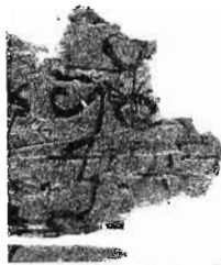
Fig. 4. Six-circled punctuation mark from Fragments 16 + 25.