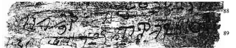
Fig. 7. Story numbering and abbreviation formula, avadāna 3, Fragments 12 + 14.