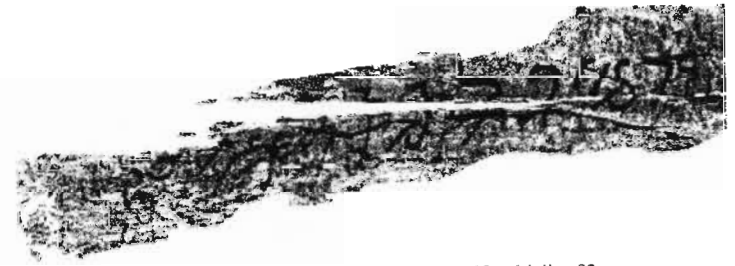
Fig. 2. Crossed out text from Fragments 12 + 14, line 82: dravado // evo-ko kurigo [viva] spa ? ?