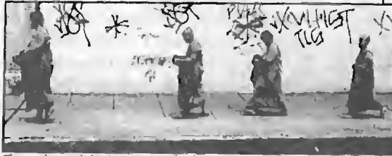
Theravada monk leading boy monks down a Los Angeles street (1977).

UNIVERSITY OF CALIFORNIA PRESS • www.ucpress.edu