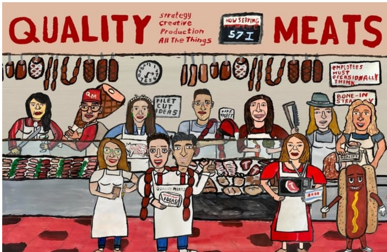
A portrait of the Quality Meats agency team.