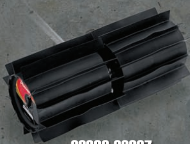
99909-33027 12-Fin Rubber Paddles

Shindaiwa highly recommends Red Armor™ engine oil for carbon deposit removal and protection against future buildup. Visit www.redarmoroil.com for more info