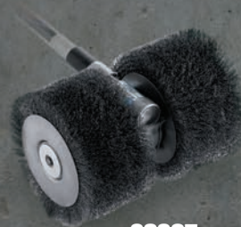
80297 Crimped Wire Brush