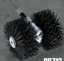
80712 Aggressive Nylon Brush