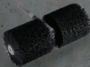
99909-11127 Nylon Brush