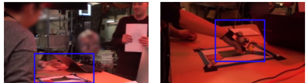
Figure 2. Observed behaviors when attempting to direct the attention of another human participant. Left: a participant using bounded hand gesture to refer to the space between the palms (highlighted in blue), Right: precise pointing meant to highlight one particular region that must be interpreted to be one piece of the tangram figure (highlighted in blue).

Joint Guided Search is the collaborative process by which agents exchange gesture (in which detection and interpretation of gesture is the first process which leads to following behavior and prediction of another’s attentional state which we call the foreground . The foreground is a measurement space which may highlight object silhouettes or highlight the underlying pixel saliency itself. An integrated approach to improving guided search for agents will require internal robotic processes to handle mapping symbol or gesture to environment, the management of appropriate and communicative deictic gesture, and the interpretation of deictic gesture as directed towards something.