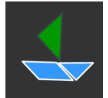
Figure 4. Top: Crowdsourcing based online interface. Bottom Left: low-level tangram foreground collected online (pixel based). Bottom Middle: Tangram figure taken from our dataset collected online. Bottom Right: high-level tangram foreground collected online (object based)

To understand when referential gesture refers to a part of the scene that is unknown or whether the reference should map to something previously known, we devised a tangram task in which the goal of the reference could be very low level maps (Figure 4) or higher level structures (Figure 4). Our goal is to minimize the measure of error between the predicted foreground and the goal foreground of each referential action exchanged between a human dyad sharing a scene. A scene that was collected online is presented to the dyad and roles are given to each participant. The setup (pictured in Figure 2) includes a shared scene composed of tangrams. One participant of the dyad is assigned the role of showing the participant what foreground they must enter in their touchscreen without any verbal communication. The observer then observes the gestures and then returns to their touchscreen to enter the foreground into the image.